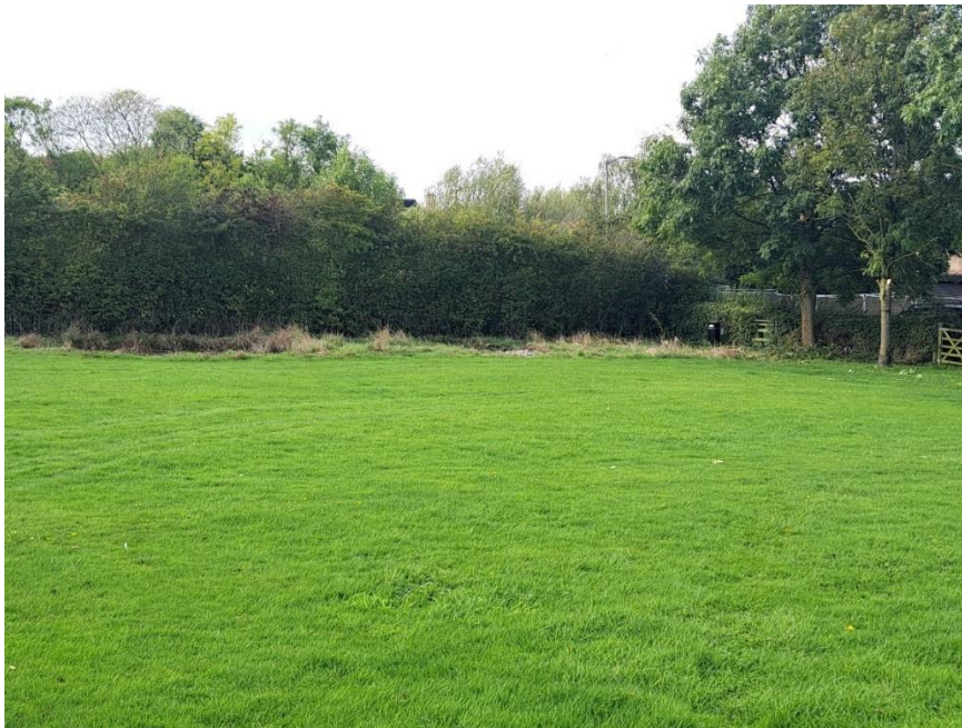
Site for new Fitness Area