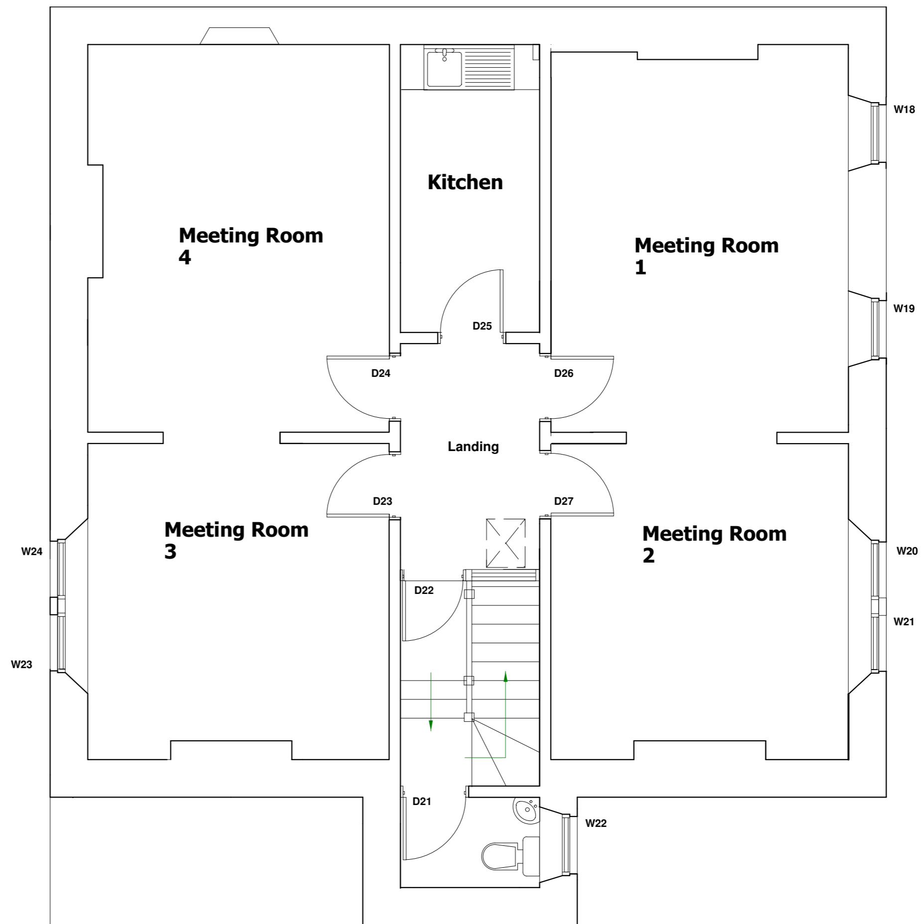
Existing First Floor Plan