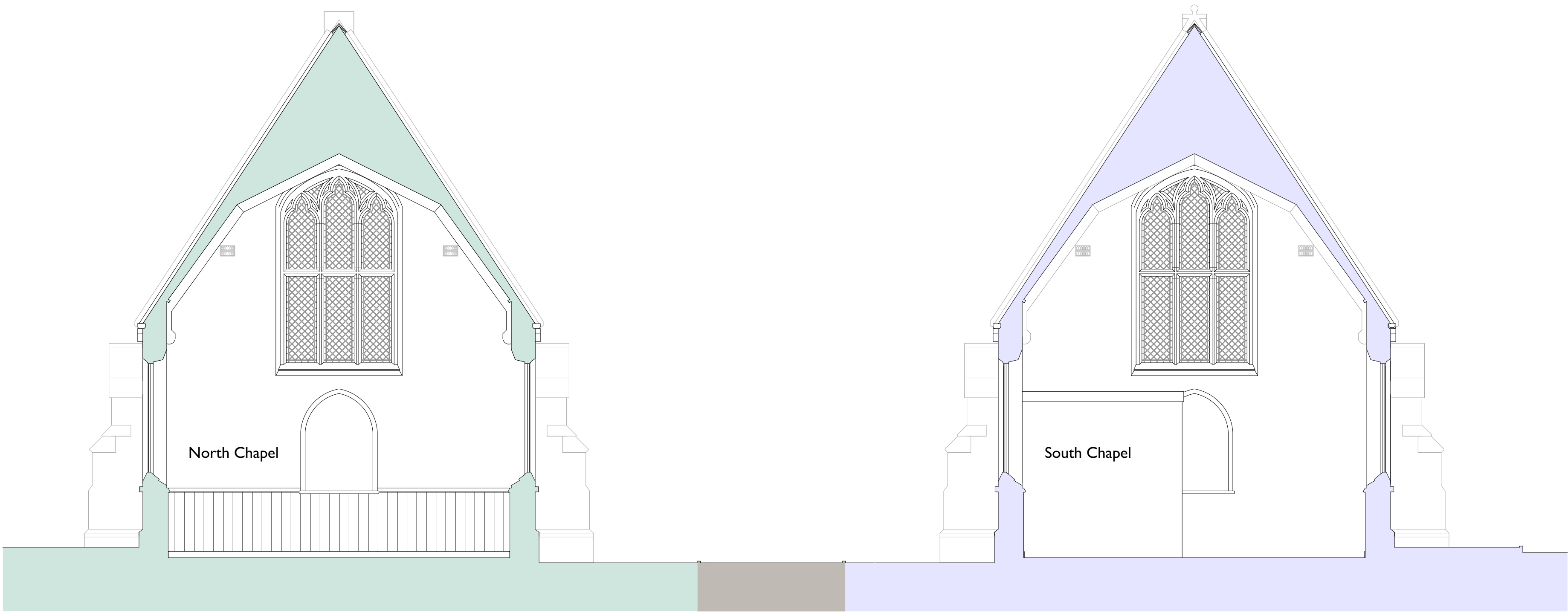
1 SECTION A-A Scale: 1:50