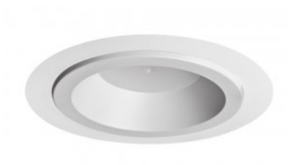
BTEC with Infill