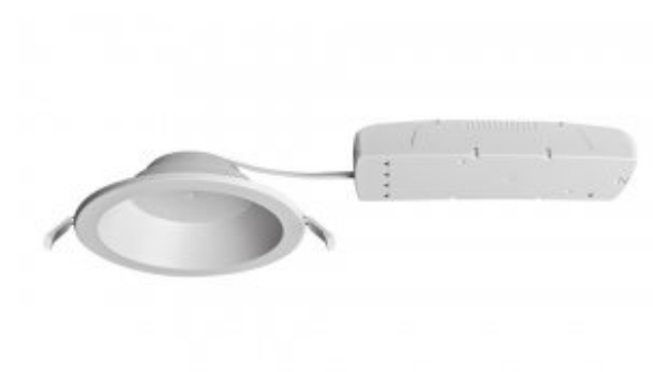
BTEC with driver