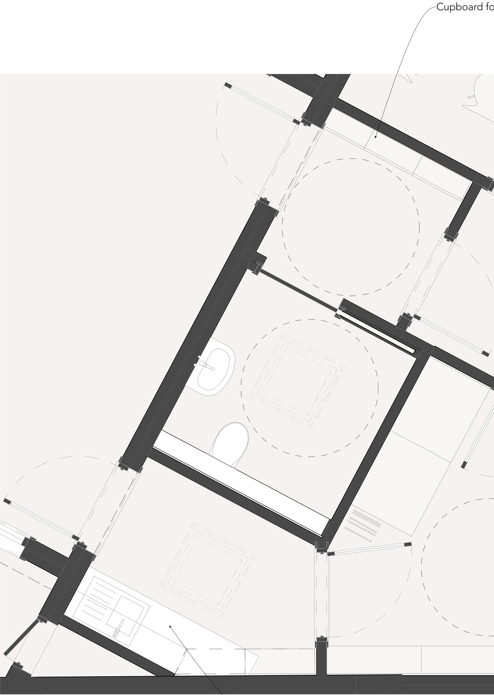
Cupboard for heating and manifold