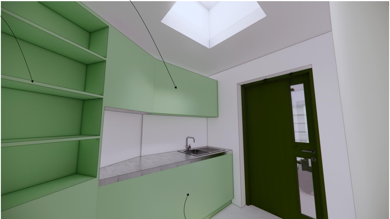
Low Units with 2 Drawers

Design Risks & Hazards: Please inspect the site and study all drawings before any work is carried out. There are services around and pipes in the ground. Any work on an existing property should have an asbestos survey. The site is located within a park with many visitors.