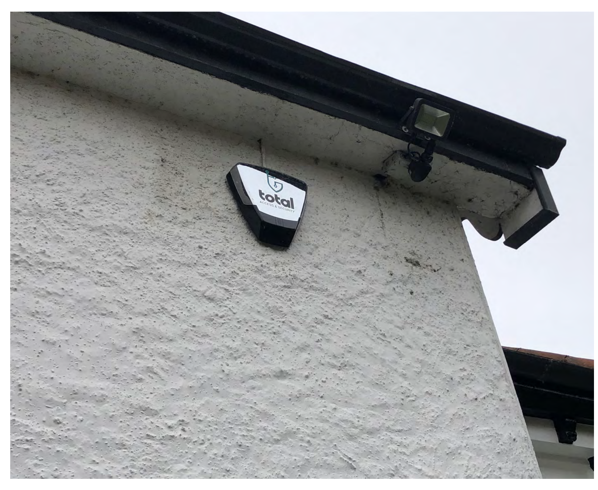
PHOTO 15 - SECURITY ALARM AND FLOODLIGHT TO BE RELOCATED, PROTECTED AND MAINTAINED DURING THE WORKS