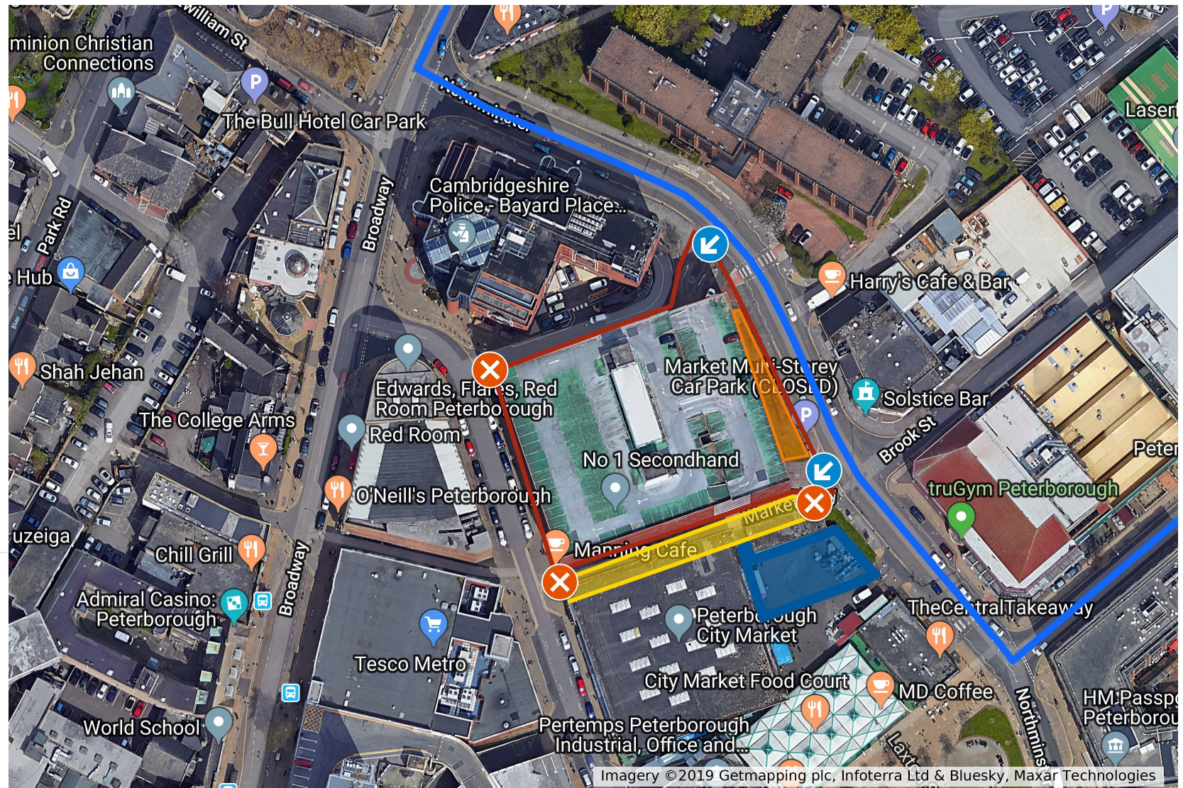
Suggested Site Plan - Note contractor to develop their own site and traffic management plan.