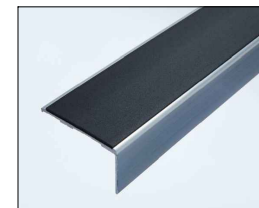
Stair nosing for steps

Notes: All dimensions to be checked on site. DO NOT SCALE FROM DRAWING. Discrepancies ambiguities and/or omissions between this drawing and information given elsewhere must be reported immediately to the architect before proceeding. THIS DRAWING IS COPYRIGHT. This drawing is to be read in conjunction with drawings:-