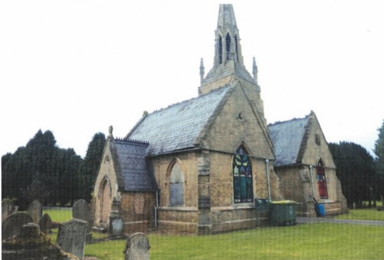
View from south east