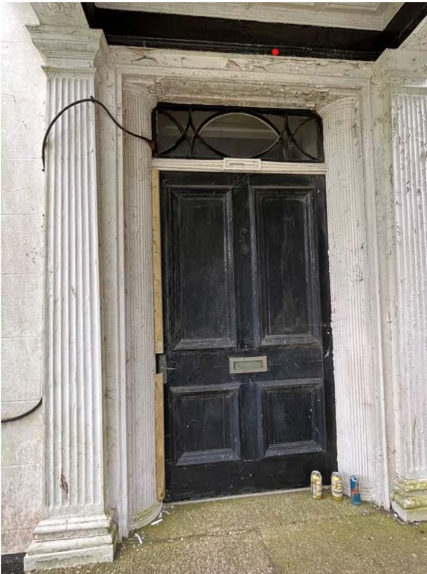
PHOTO 2 - FRONT DOOR SHOWING ENGAGED PILASTERS AND IN AN/TIS QUARTER COLUMNS BOTH SIDES OF DOOR