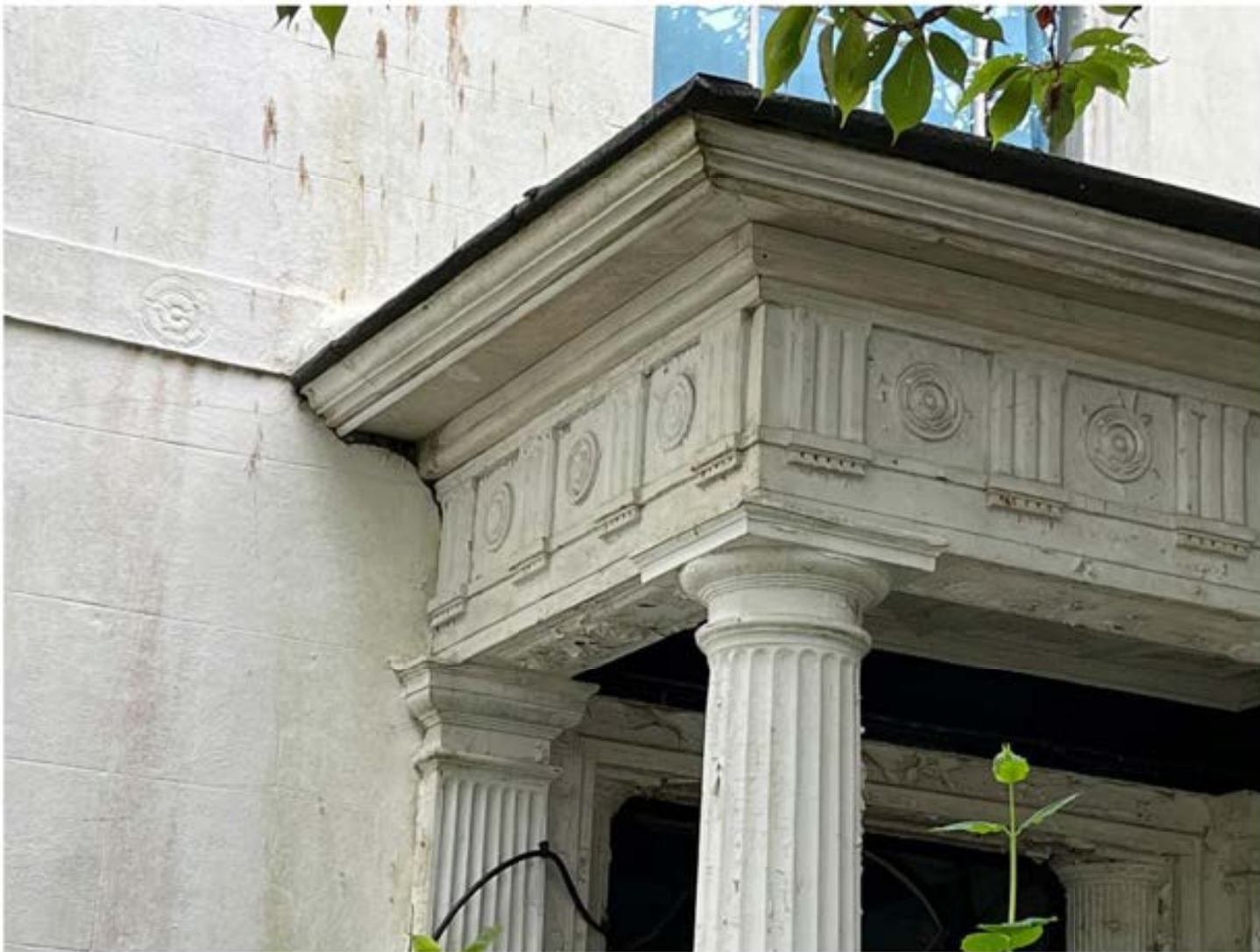
PHOTO 1 - CORNER OF PORCH/PORTIO