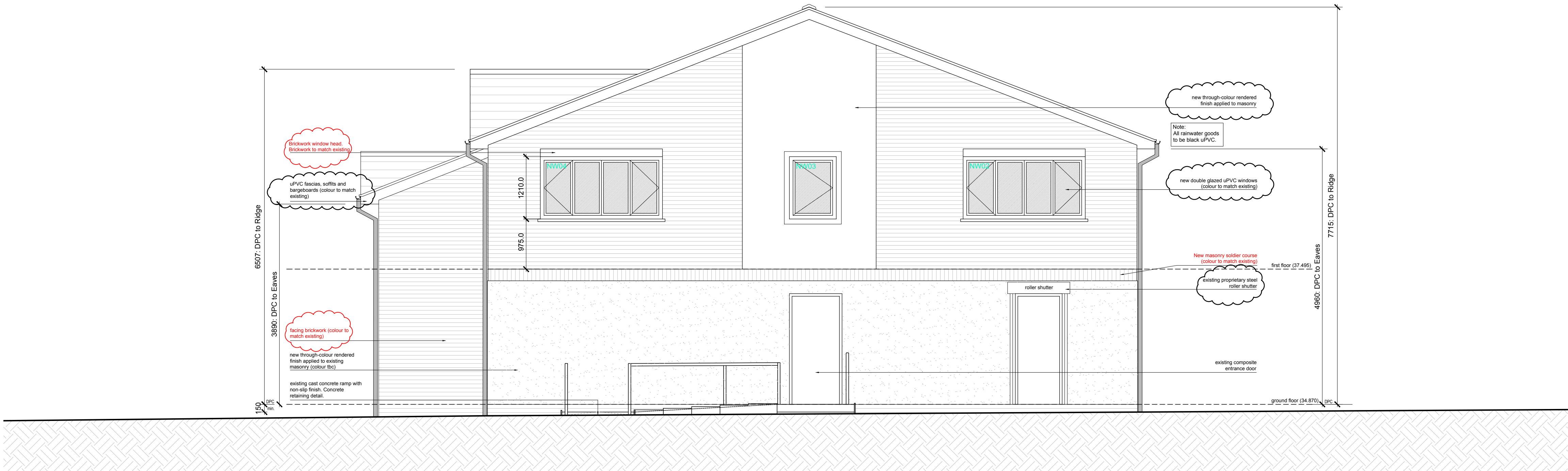
WEST ELEVATION SCALE: 1:50 @ A1