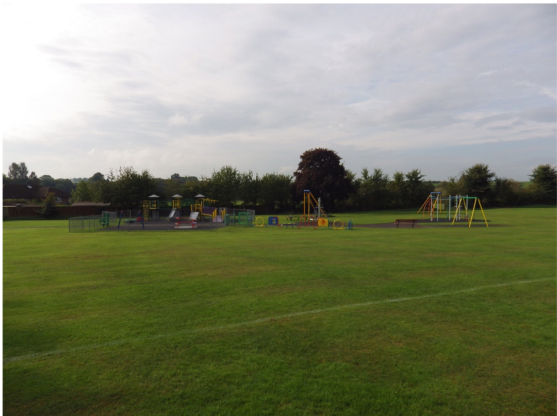
War Memorial Recreation Ground