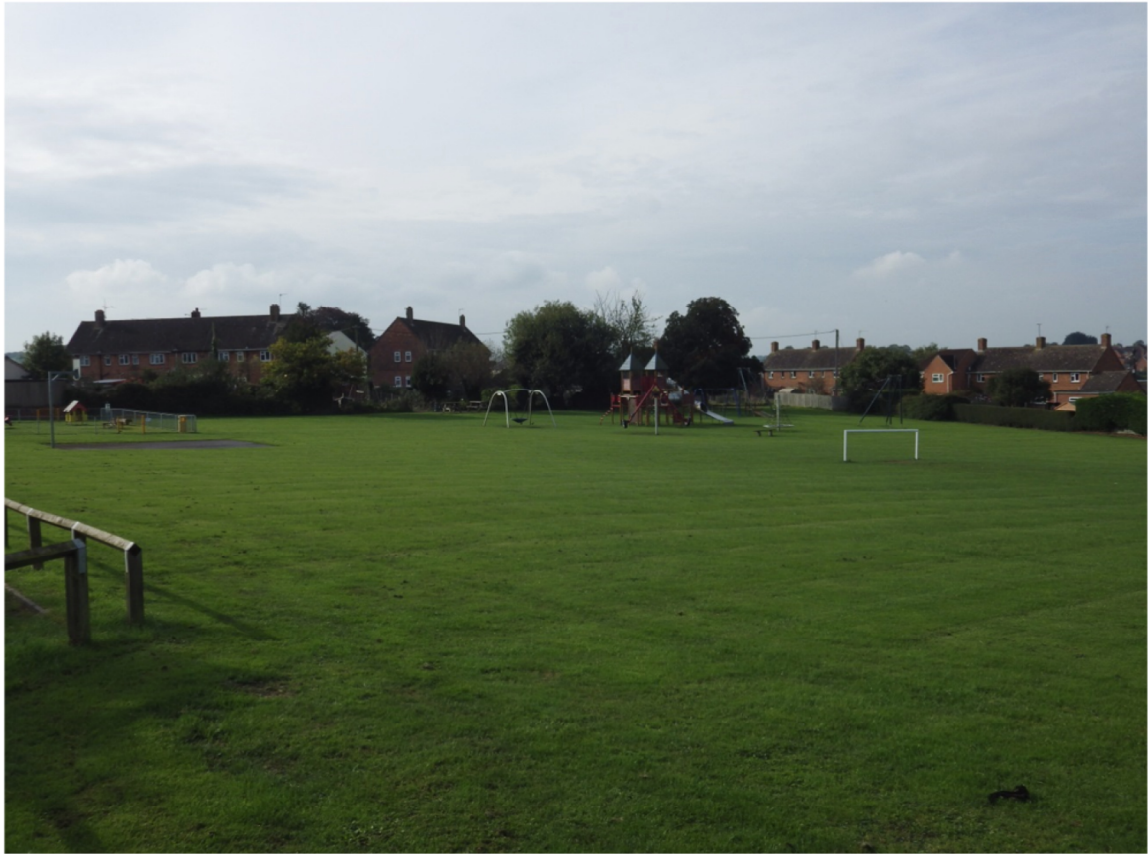
Rixon Recreation Ground