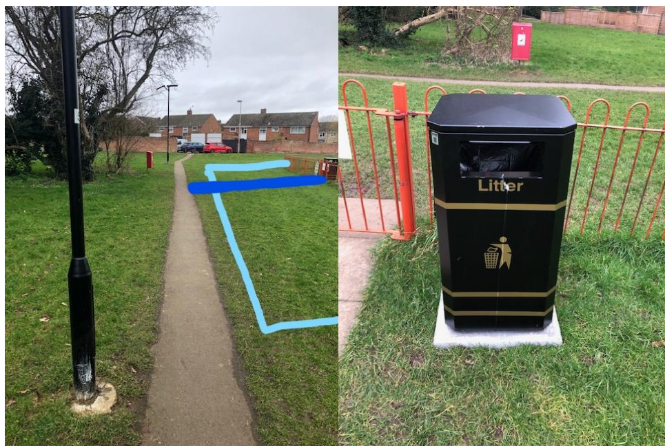
Light Blue: suggested new fencing location Dark Blue: suggested new pathway into the site Existing Bin: Relocate to the front of site next to pedestrian gate