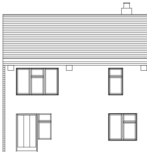
04 WEST ELEVATION - AS EXISTING 1200 1:100 @ A3