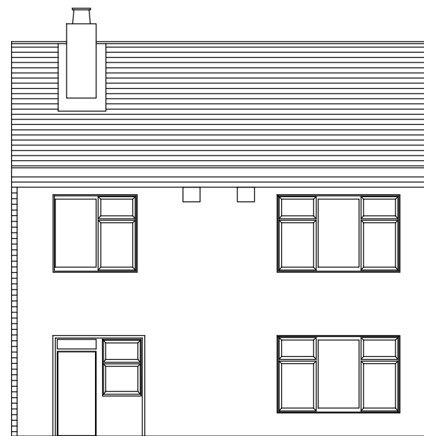
02 EAST ELEVATION - AS EXISTING 1200 1:100 @ A3