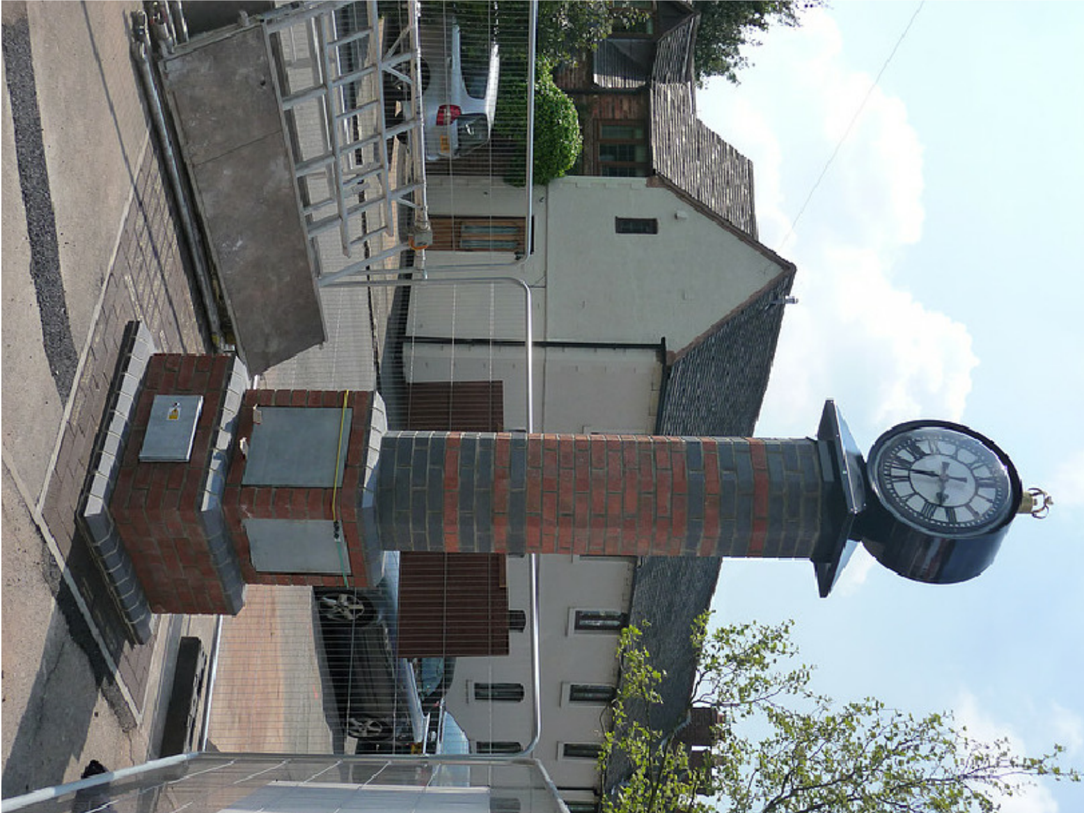
Photograph of finished clock tower