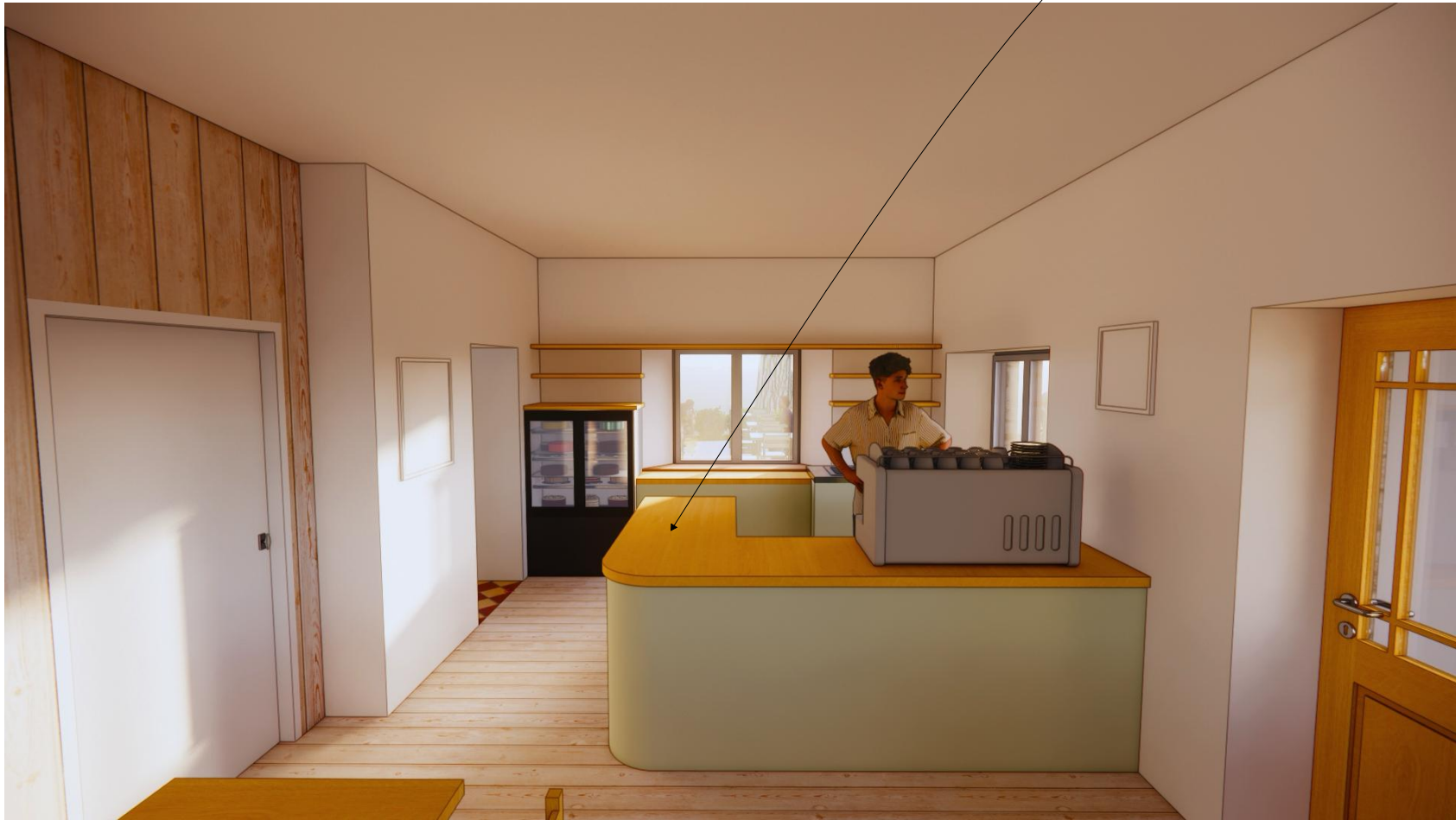
40mm Oak Timber Surface