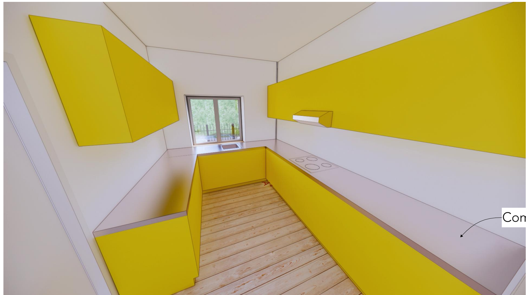
Commercial Grade Counter Top