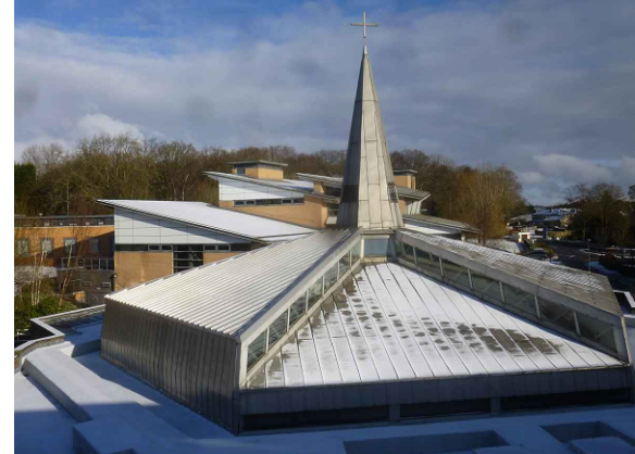
South View from Main Building