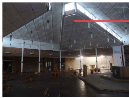
North West Segment