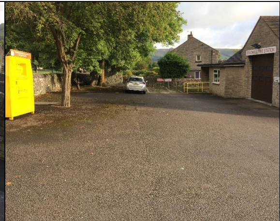
B – View of front forecourt