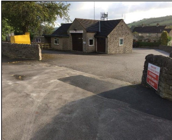
A – View of main entrance

Insert photos with description of relevance