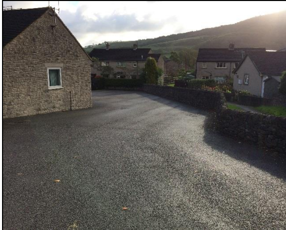
C – Side elevation