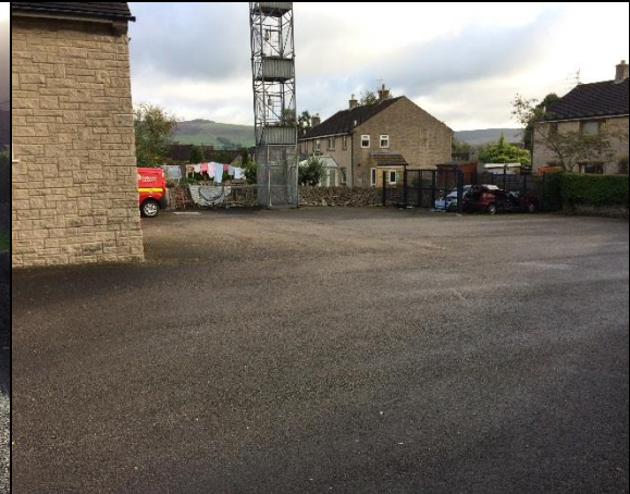
D – View of rear yard