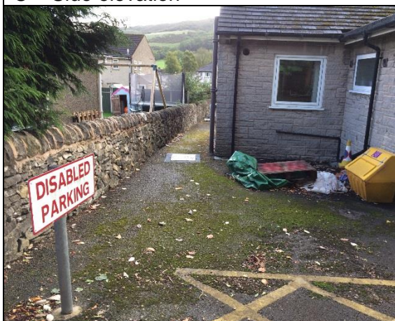
E – View of footpath to rear