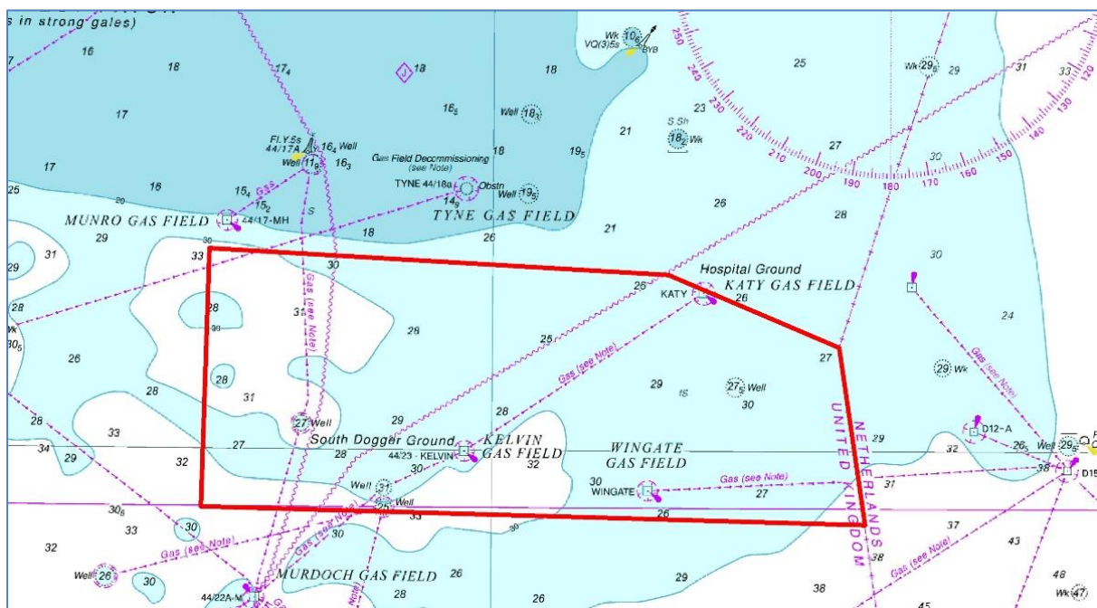
Figure 2 - Close-up of Survey Area