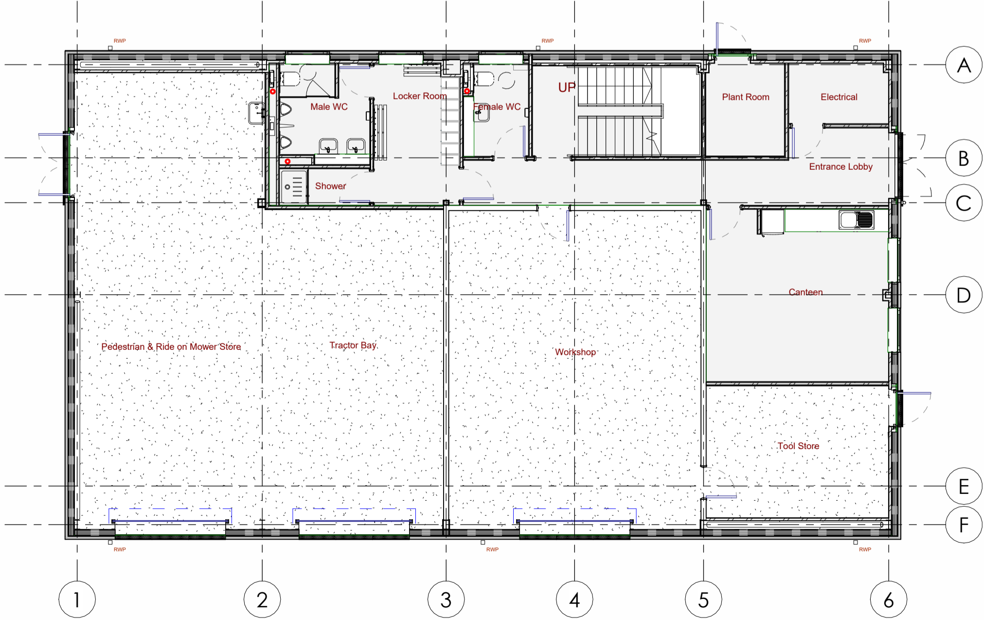
PROPOSED GROUND FLOOR 1 : 100