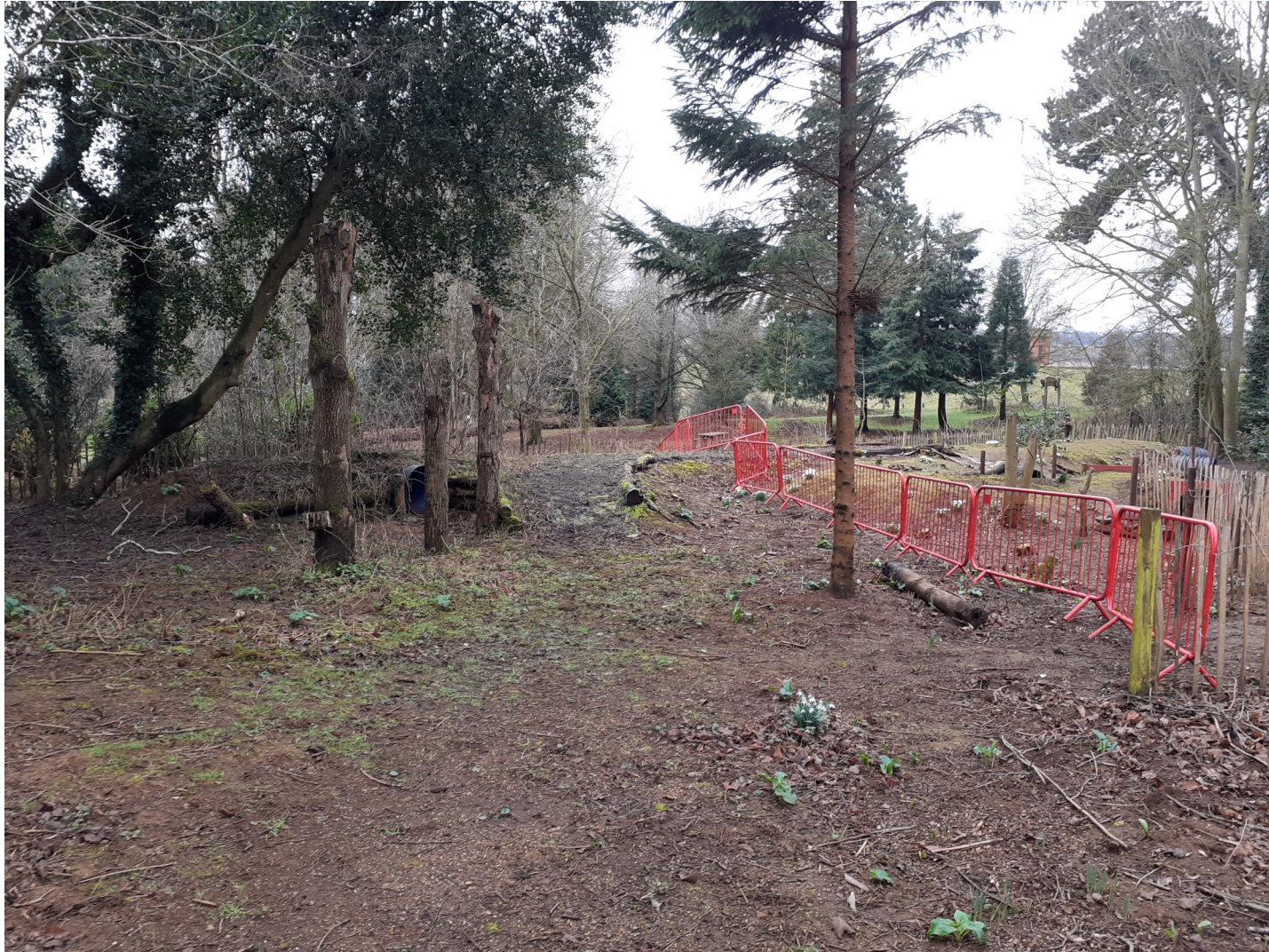
Multi-play “Lightning Tree” feature area (view to the west)