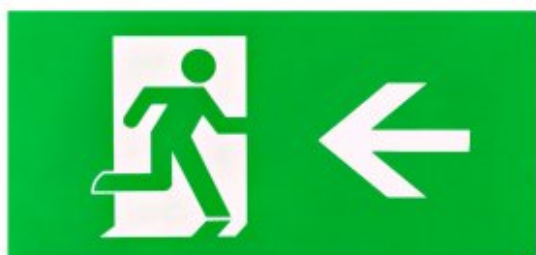
EXI LL ISO7010