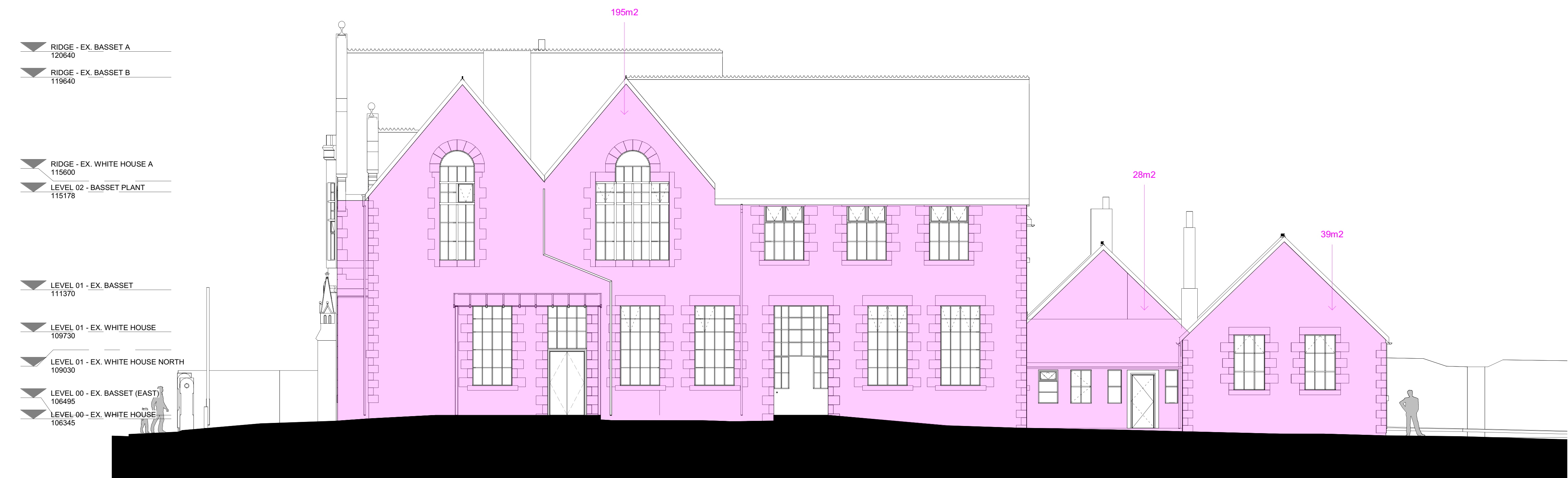
SECTIONAL ELEVATION - GA - EXISTING - LL - NORTH - GRANITE FACADE REPAIR & REPOINTING 1:100