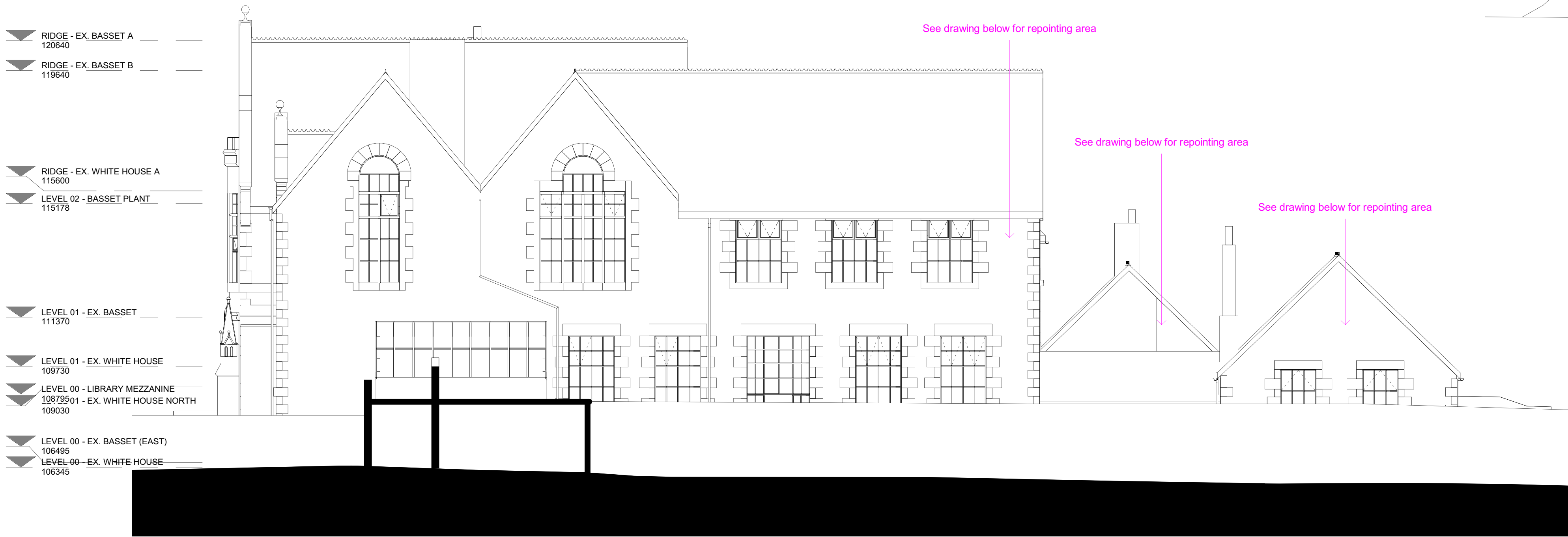
SECTIONAL ELEVATION - GA - EXISTING - KK - NORTH - GRANITE FACADE REPAIR & REPOINTING 1:100