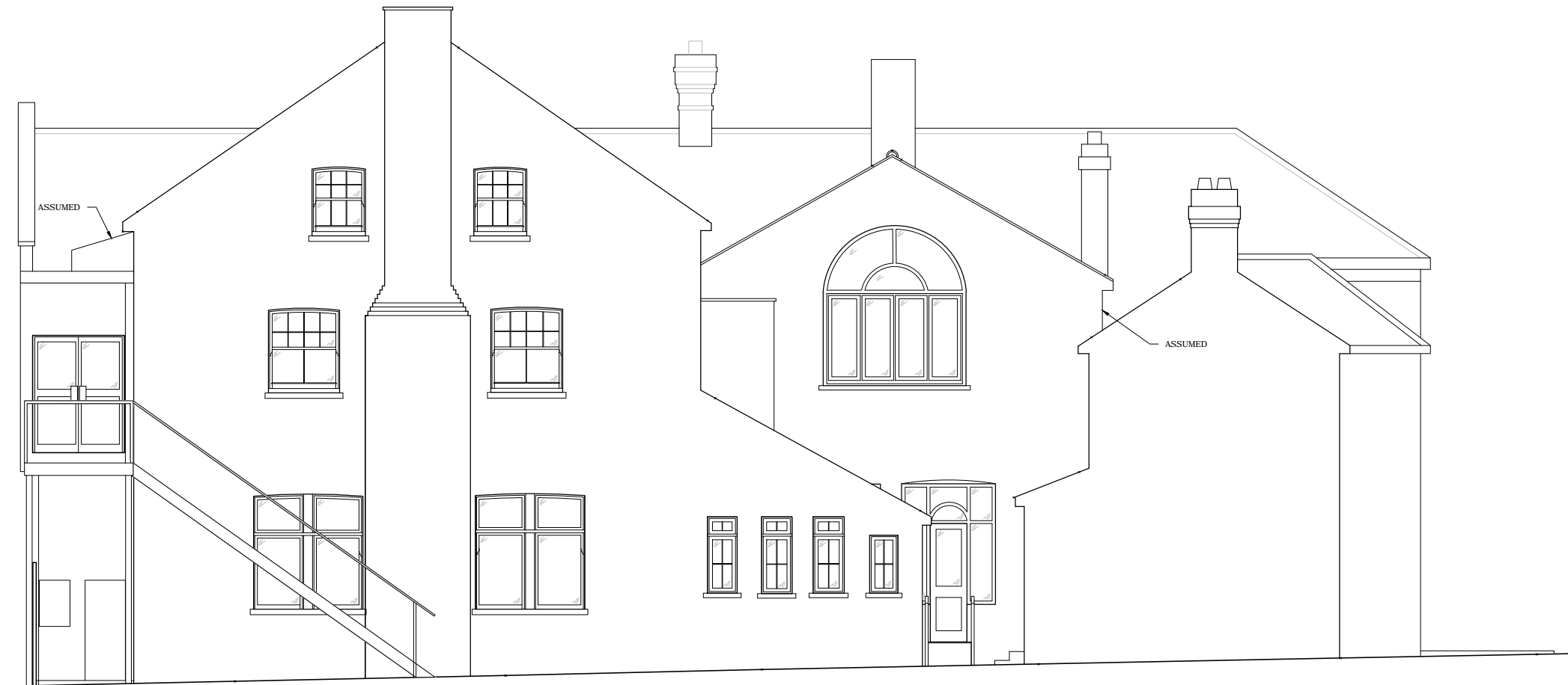
REAR ELEVATION (WEST) SCALE 1:100 0 1 2 3 4 5m

General Notes: Do not scale this drawing. Work to figured dimensions only. This drawing is copyright of THS Concepts and should only be reproduced with their express permission. Check all dimensions on site. Any discrepancies should be reported to THS Concepts prior to commencement.