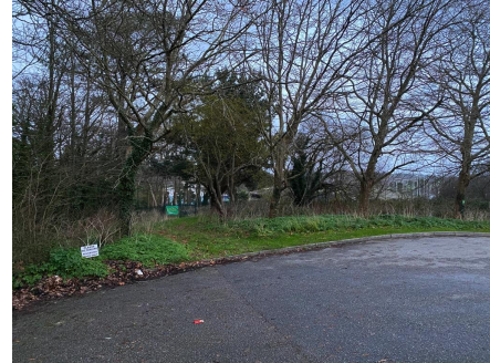
Entrance to informal path to cemeteries from Sainsbury's access road