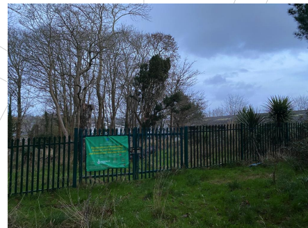
View of area within fence for conservator's compound