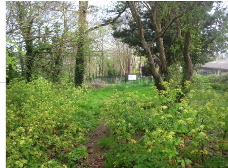
Informal path looking north towards cemeteries