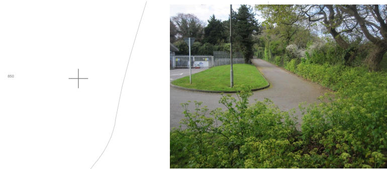
View of area of grass proposed for contractor's compound from north