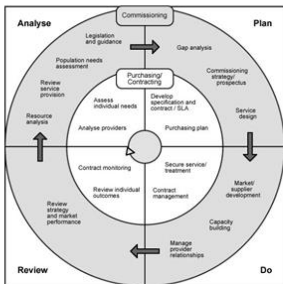
Fig.1. BCC Enabling Commissioning Framework

This document seeks to provide additional information in relation to this specific commissioning activity and is intended for use by a range of stakeholders in order to develop a cooperative approach to the commissioning model that will go out to tender in 2017. In particular, this document is intended for: