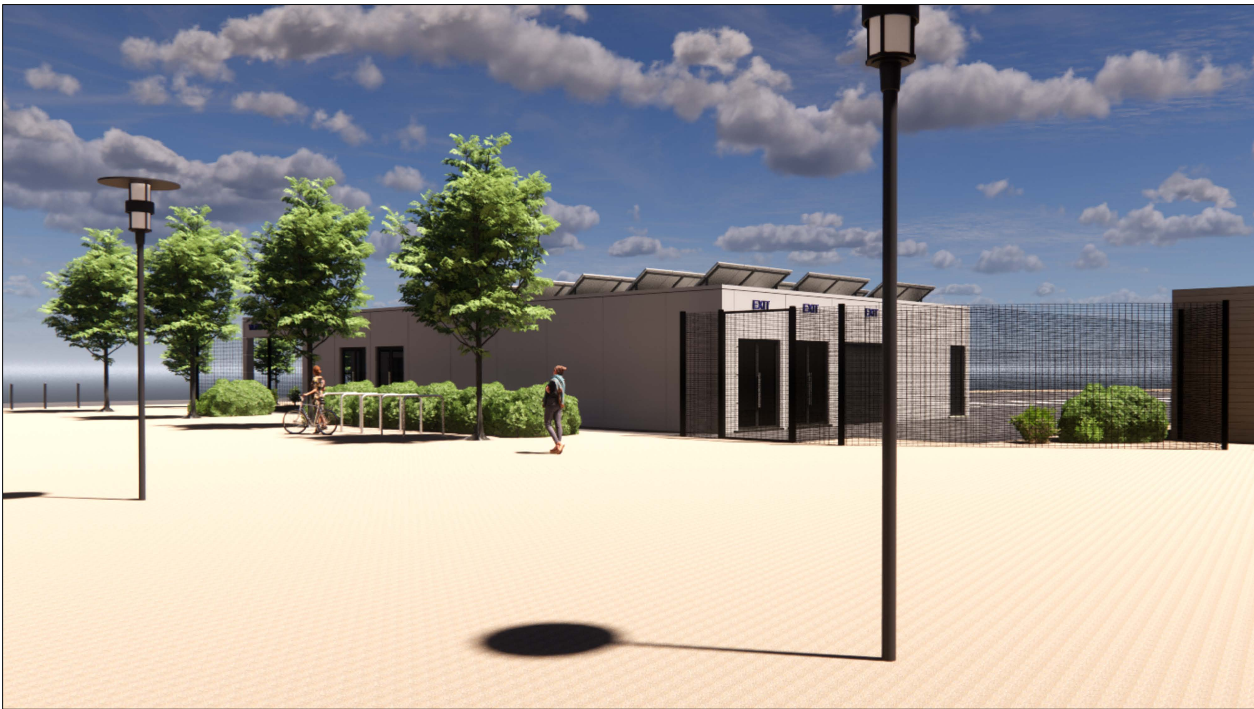
2 VISUAL EYE-LEVEL PERSPECTIVE 2 SCALE : NTS