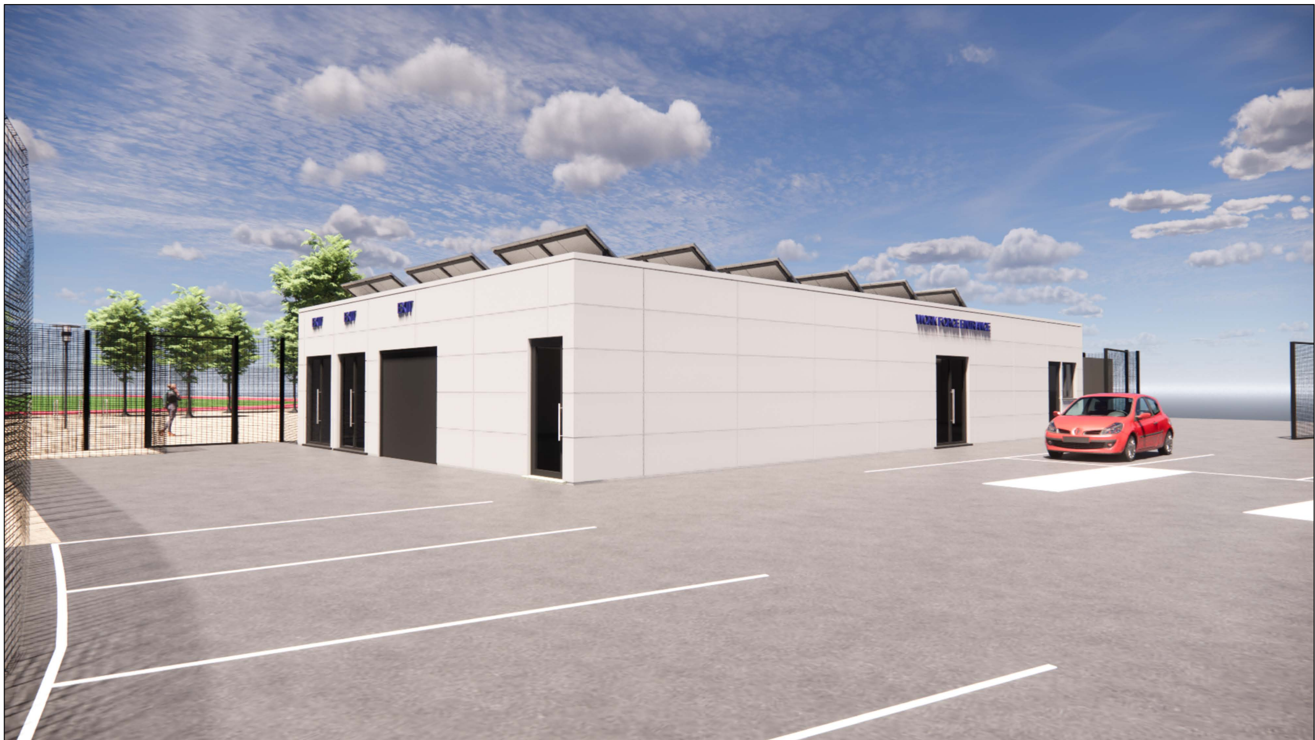
3 VISUAL EYE-LEVEL PERSPECTIVE 3 SCALE : NTS