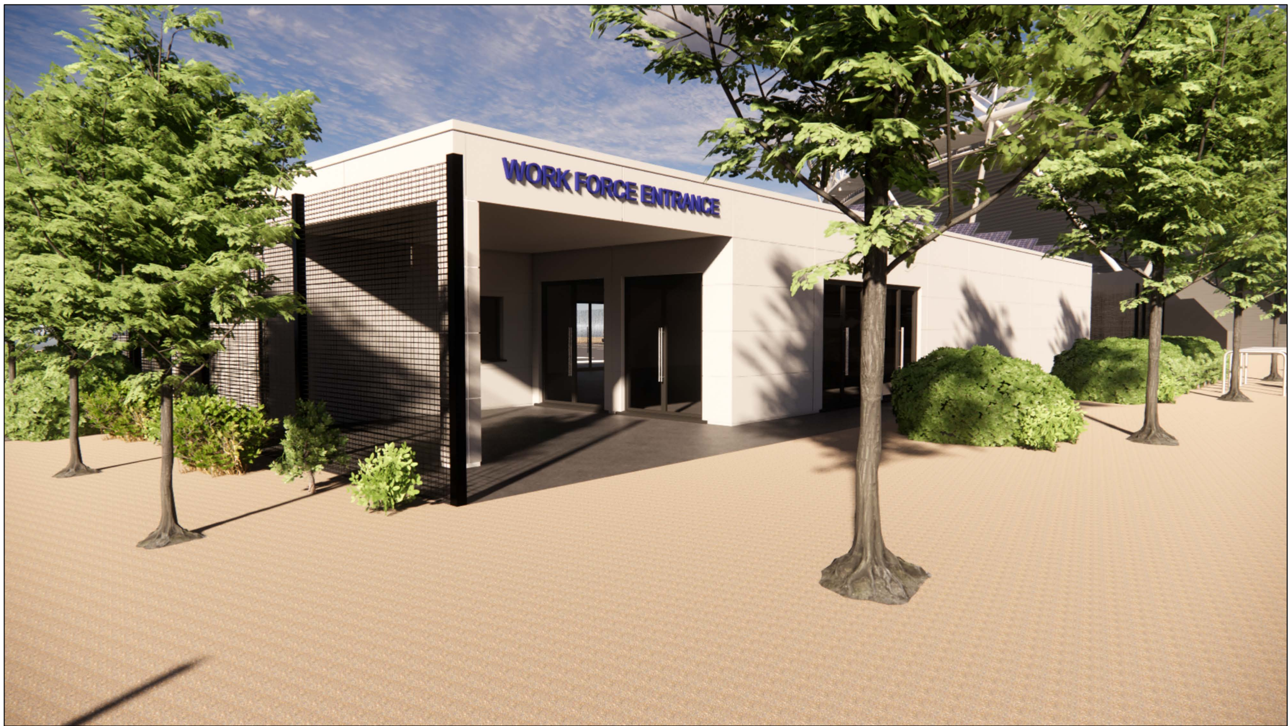
1 VISUAL EYE-LEVEL PERSPECTIVE 1 SCALE : NTS