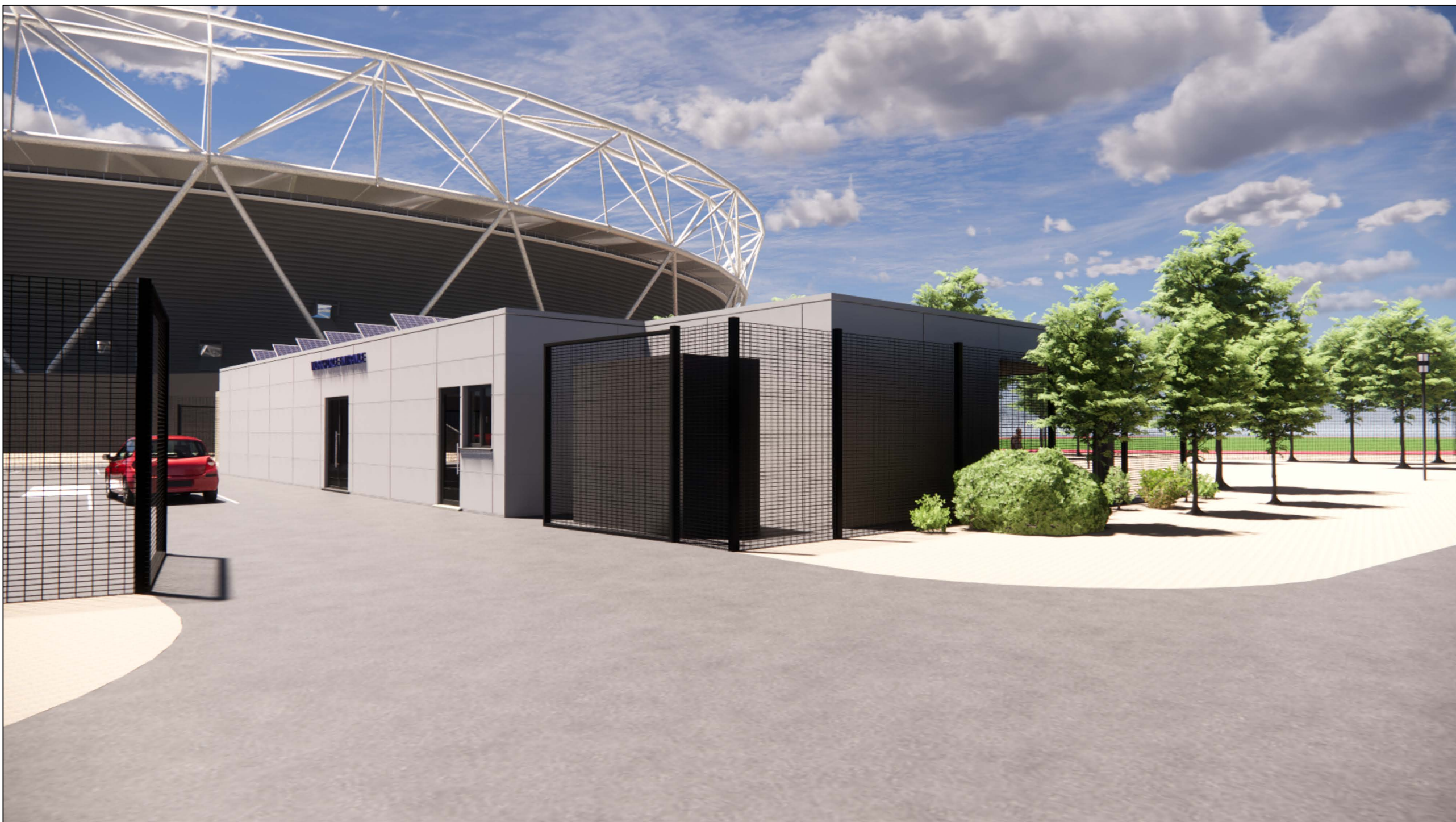
4 VISUAL EYE-LEVEL PERSPECTIVE 4 SCALE : NTS