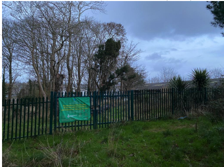
View of area within fence for conservator's compound

PRELIMINARY SUBJECT TO AGREEMENT WITH CLIENT, SEPARATE LANDOWNER AND MAIN CONTRACTOR