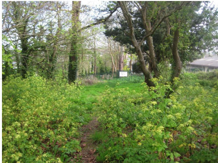
Informal path looking north towards cemeteries