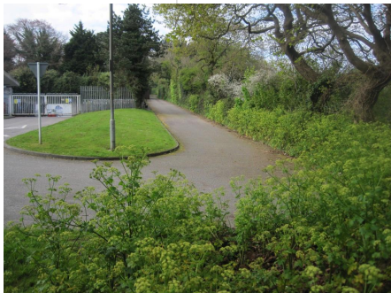
View of area of grass proposed for contractor's compound from north