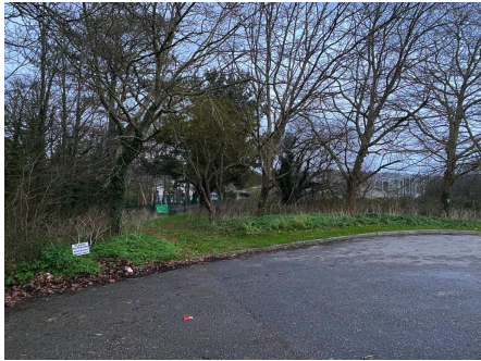
Entrance to informal path to cemeteries from Sainsbury's access road