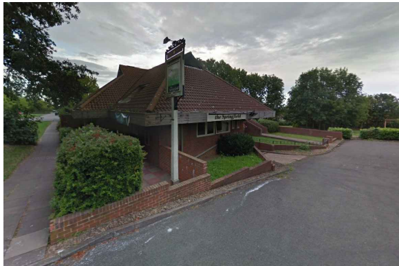
Photo 1 'The Springfield' Public House