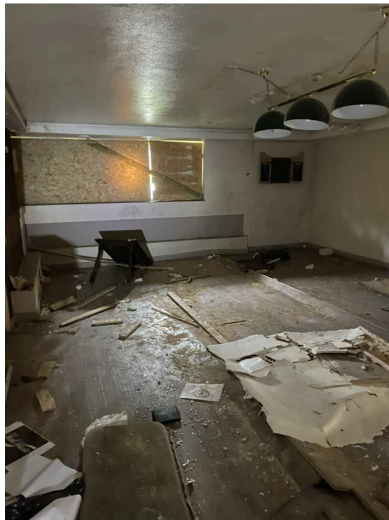
Photo 10 Interior of existing building