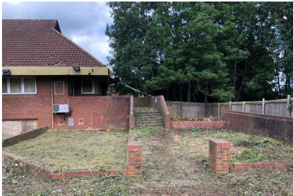
Photo 3 'The Springfield' Public House