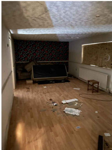
Photo 12 Interior of existing building