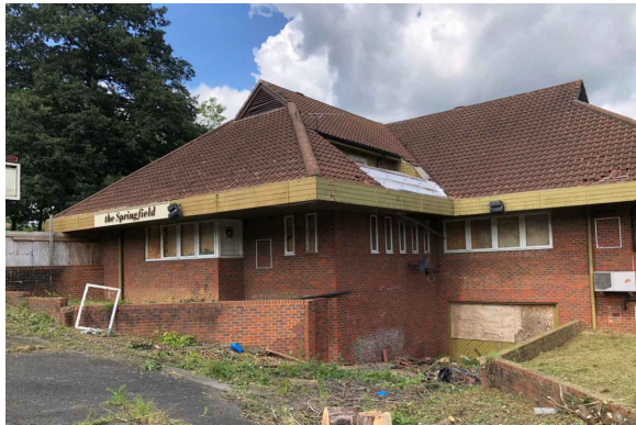
Photo 4 'The Springfield' Public House