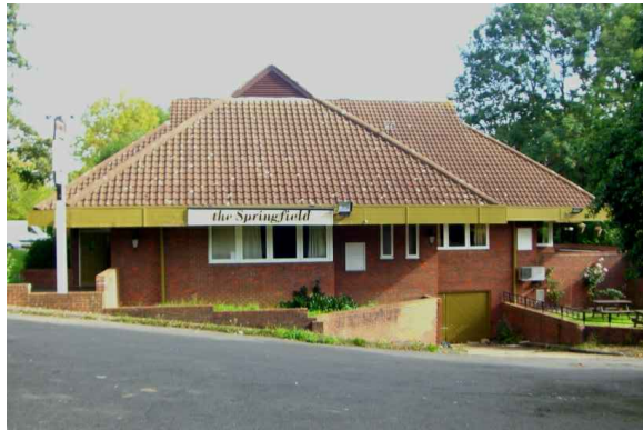
Photo 2 'The Springfield' Public House