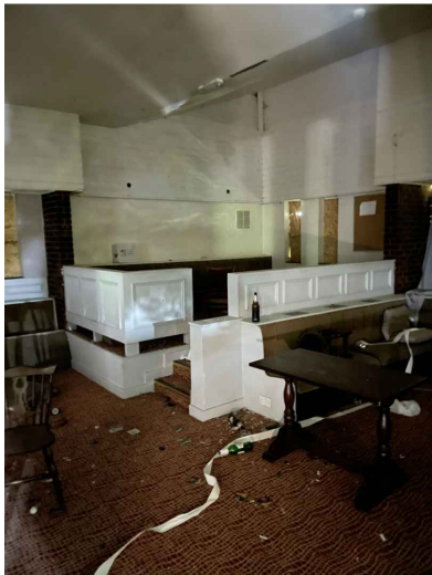
Photo 13 Interior of existing building