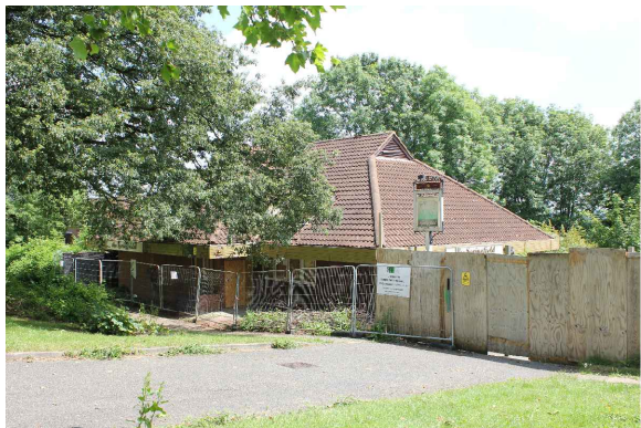
Photo 5 The existing building and site entrance