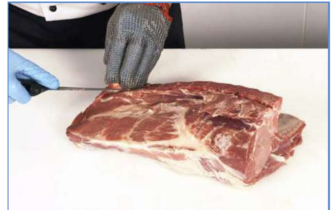
3 Remove the bones by sheet boning ...