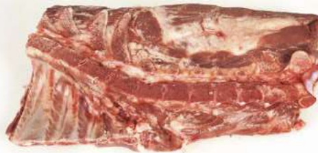
2 Collar of Pork – bone-in.