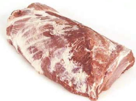
6 Collar – boneless.