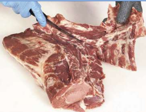
4 ... taking care not to cut into underlying muscles.