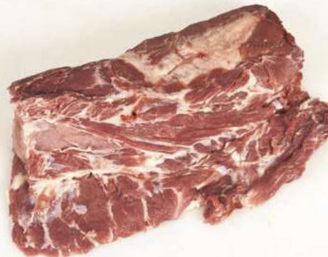
5 Collar – boneless.