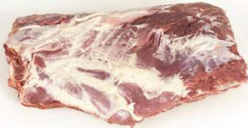
1 Collar of Pork – bone-in.