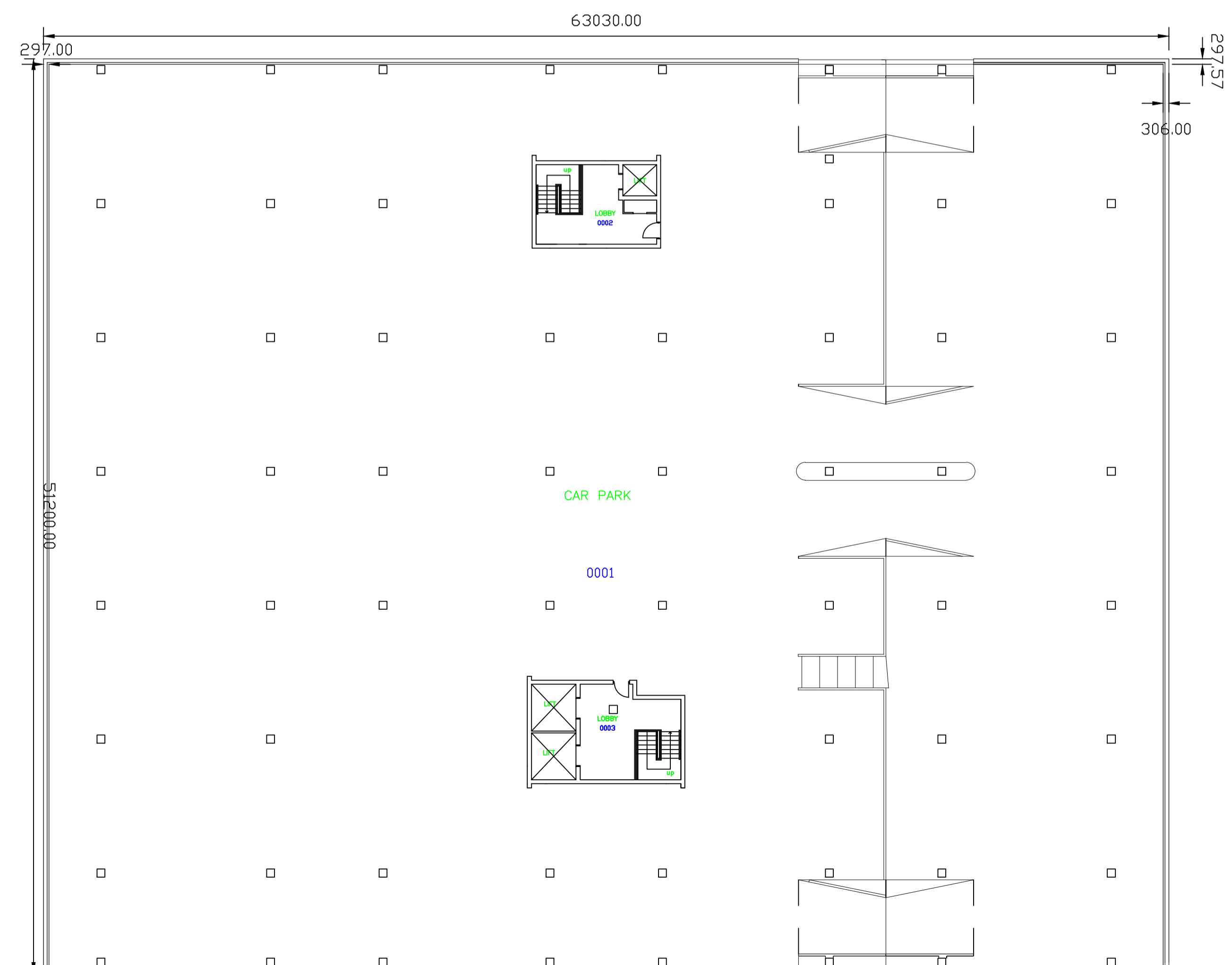
FIFTH FLOOR LAYOUT