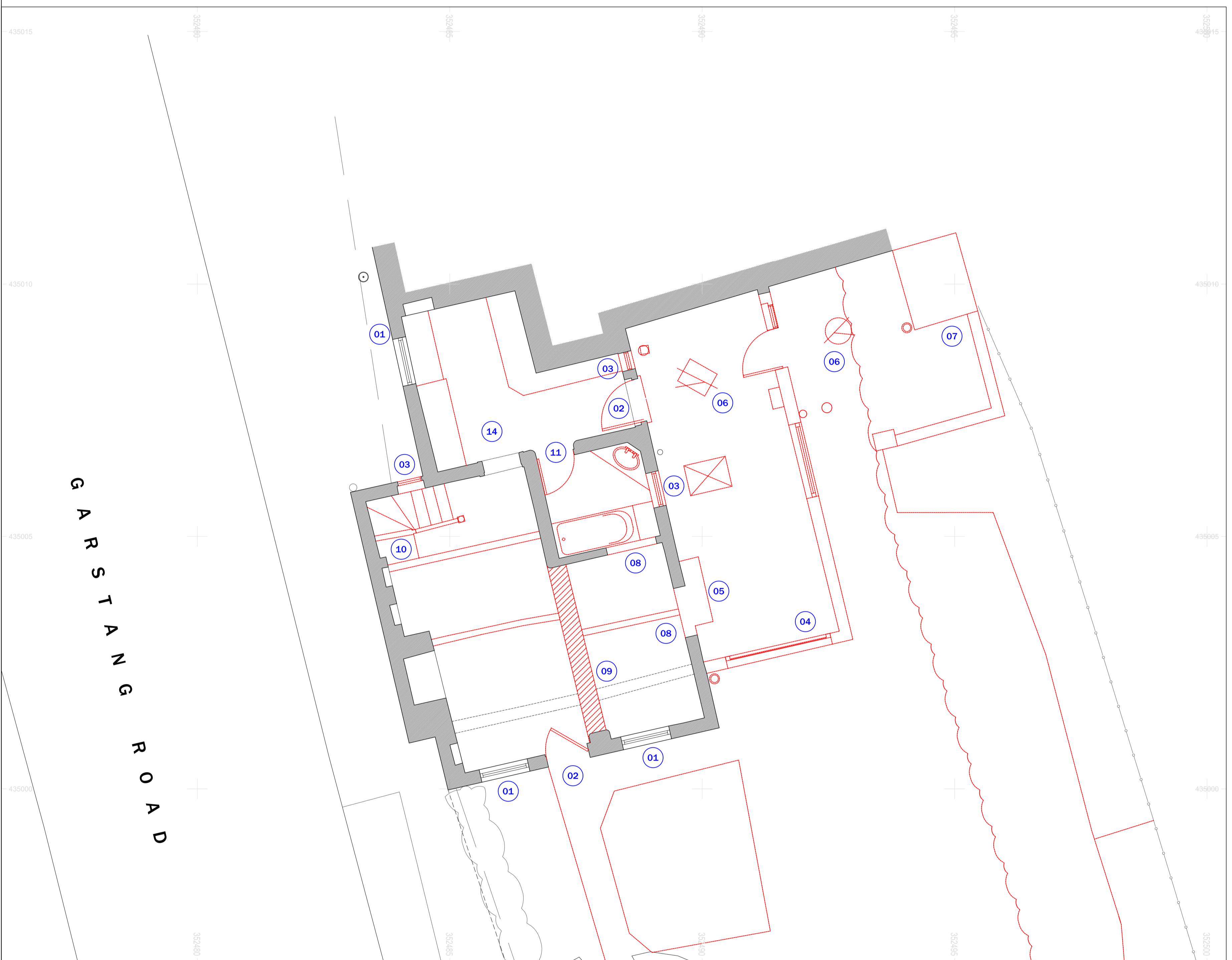
GROUND FLOOR PLAN SHOWING DEMOLITIONS