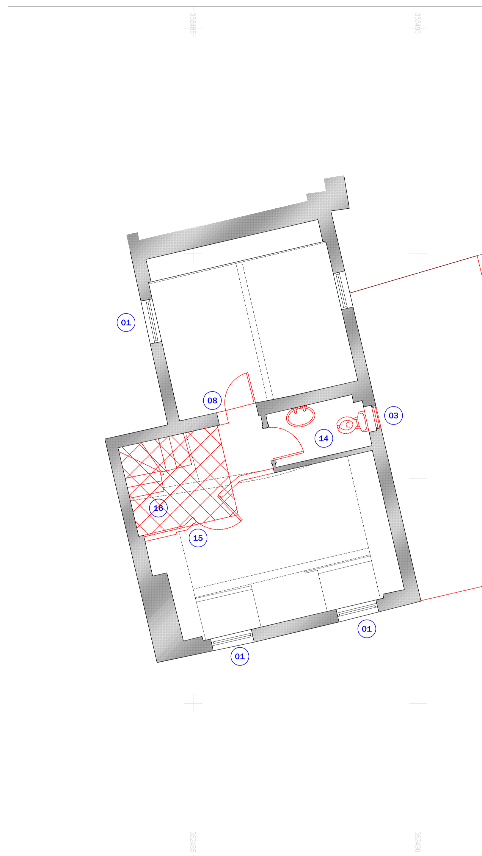
FIRST FLOOR PLAN SHOWING DEMOLITIONS