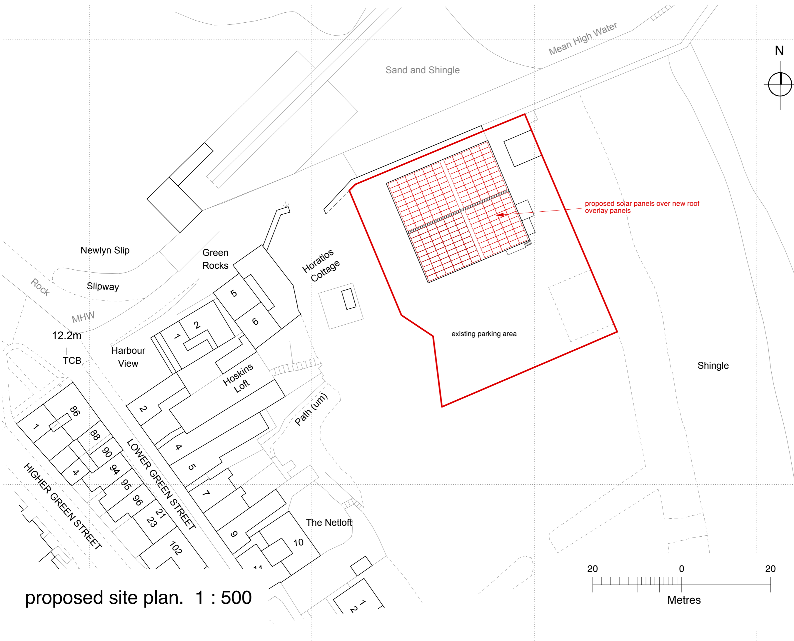
proposed site plan. 1 : 500