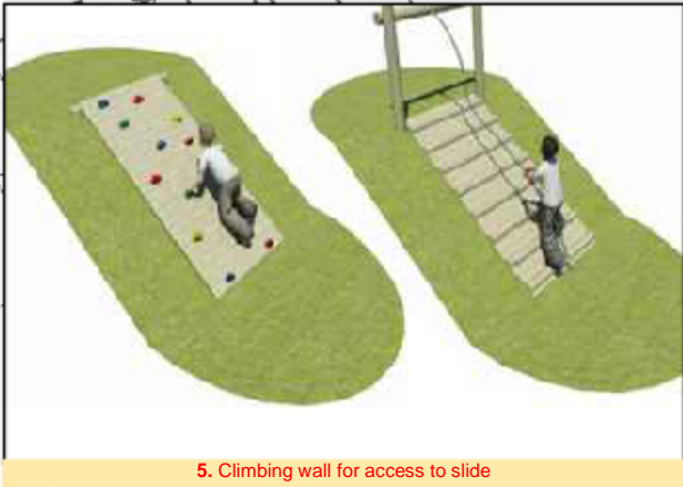
5. Climbing wall for access to slide