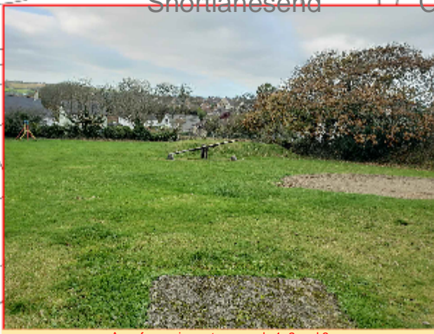
Area for equipment proposals 1, 2 and 3.

© This drawing is Copyright. It should not be relied on or used in circumstances other than those for which it was originally prepared and for which Cornwall Council was originally commissioned. Cornwall Council accepts no responsibility for this drawing to any party other than the person(s) by whom it was commissioned.