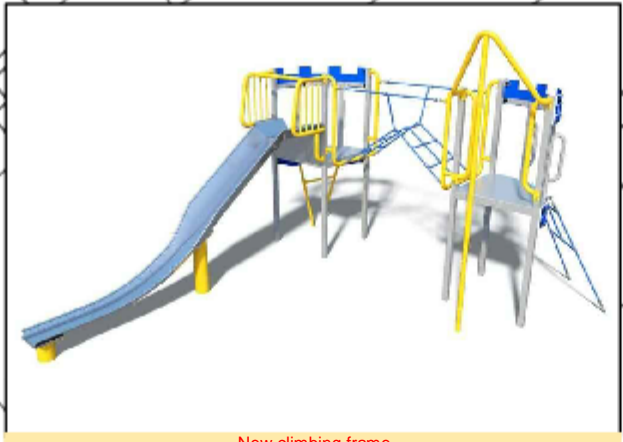
New climbing frame

Proposed location for the agility trail incorporated into the existing grass mound to include: stepping logs, balance beam, rope bridge and saddle net on the top on the mound.