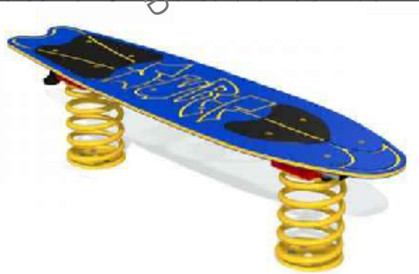
4. Large Boat Springer and Surfboard Springer.