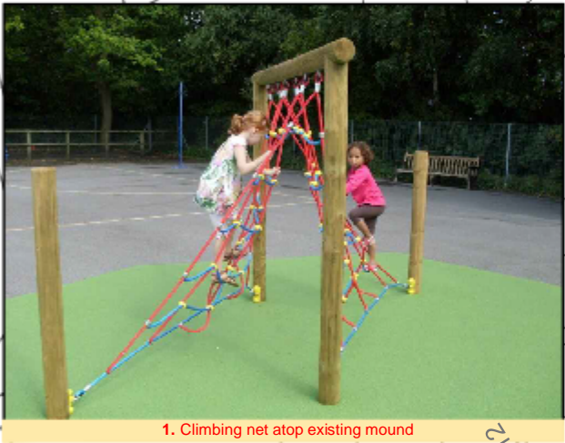
1. Climbing net atop existing mound

Proposed location for a shelter and additional benches.