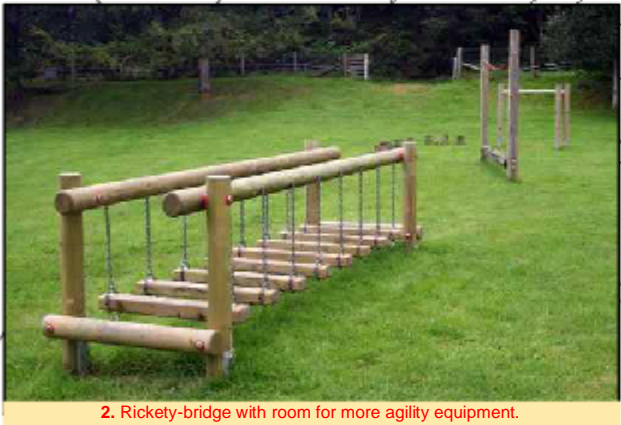
2. Rickety-bridge with room for more agility equipment.