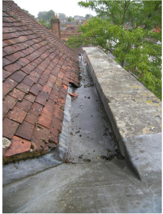
parapet gutter and other details