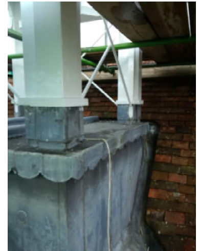
Cupola flat roof base