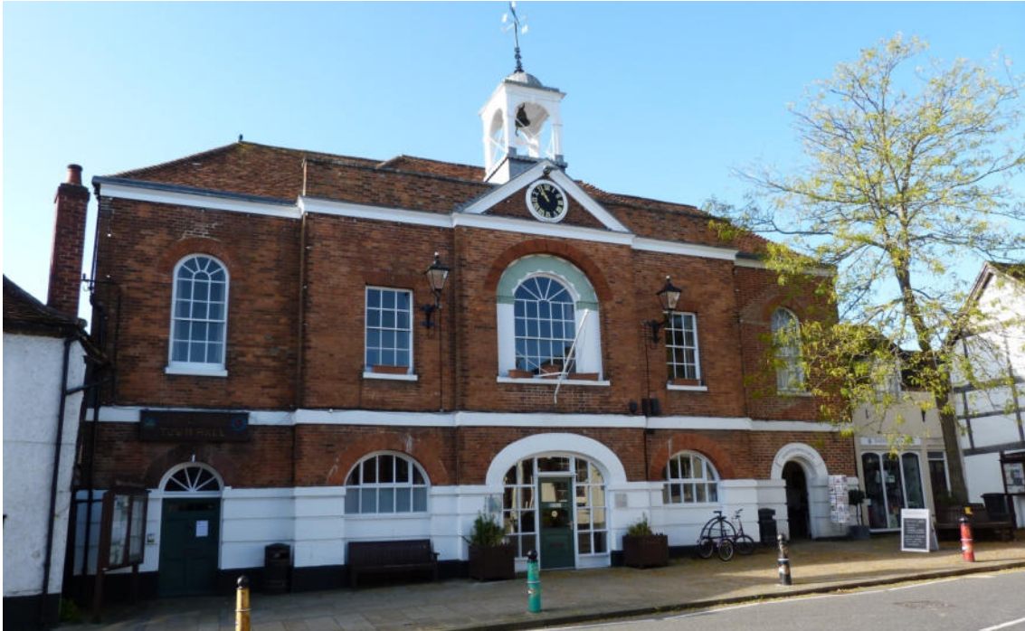
Front, east elevation

These photographs are intended to assist in pricing the work, but please note they have been taken over the past 8 years; we cannot guarantee the current condition.