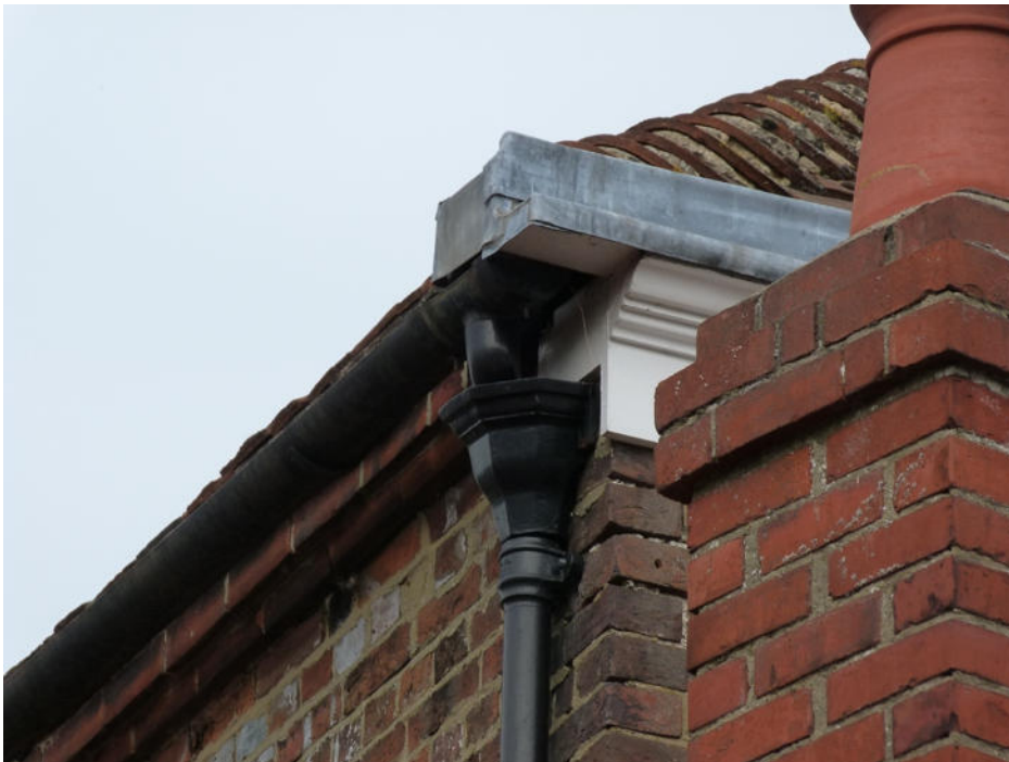
end of lead lined timber gutter where overflow to be fitted.