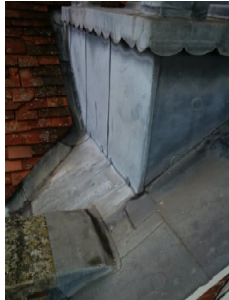
cupola base and cladding to pediment and into gutters either side