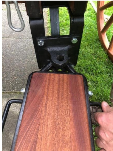
Connecting the Trail to the Limber