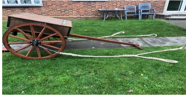
Fitting the ropes drag and braking ropes