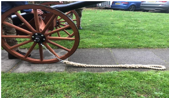
Braking Rope fitted