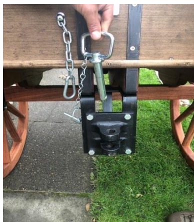
Removing the Bolt from the Limber