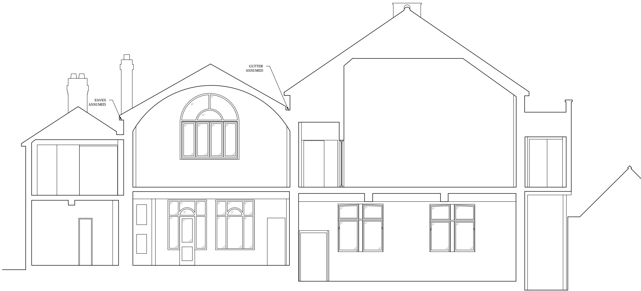
SECTION A-A SCALE 1:100 0 1 2 3 4 5m

General Notes: Do not scale this drawing. Work to figured dimensions only. This drawing is copyright of THS Concepts and should only be reproduced with their express permission. Check all dimensions on site. Any discrepancies should be reported to THS Concepts prior to commencement.