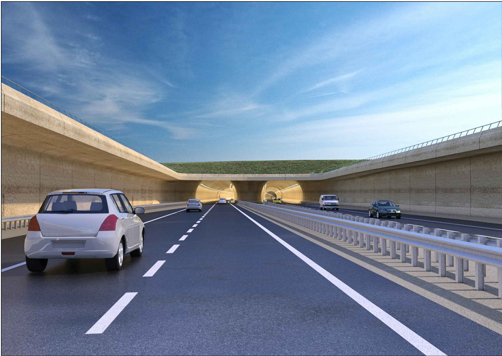
DRIVER'S VIEW OF TUNNEL ENTRANCE

PERSPECTIVE VIEW ILLUSTRATION AS REPLICATED FROM OEMP