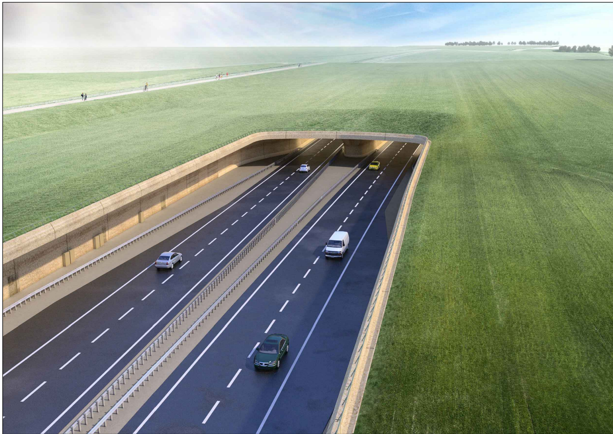
AERIAL VIEW OF TUNNEL ENTRANCE

AERIAL VIEW ILLUSTRATION AS REPLICATED FROM OEMP