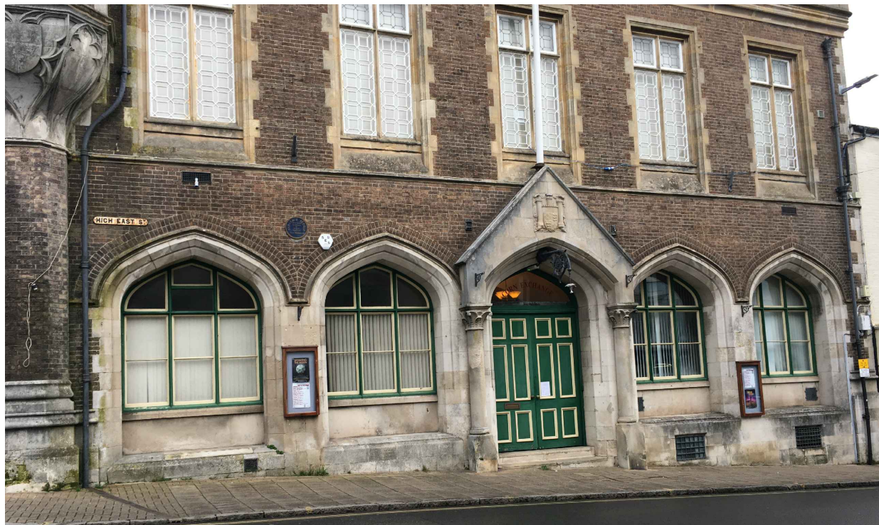
PHOTO OF EXISTING SOUTH ELEVATION