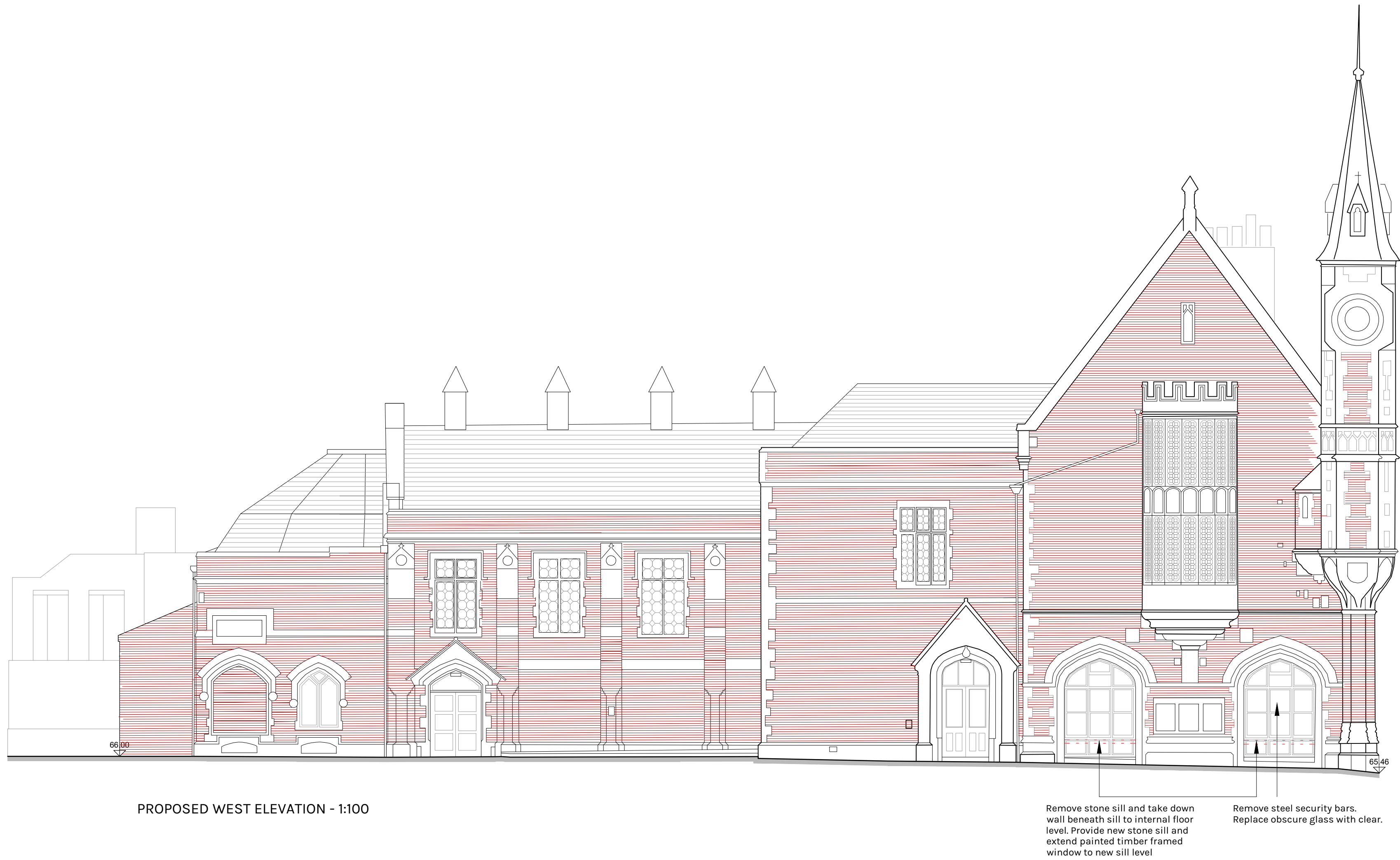
PROPOSED WEST ELEVATION - 1:100