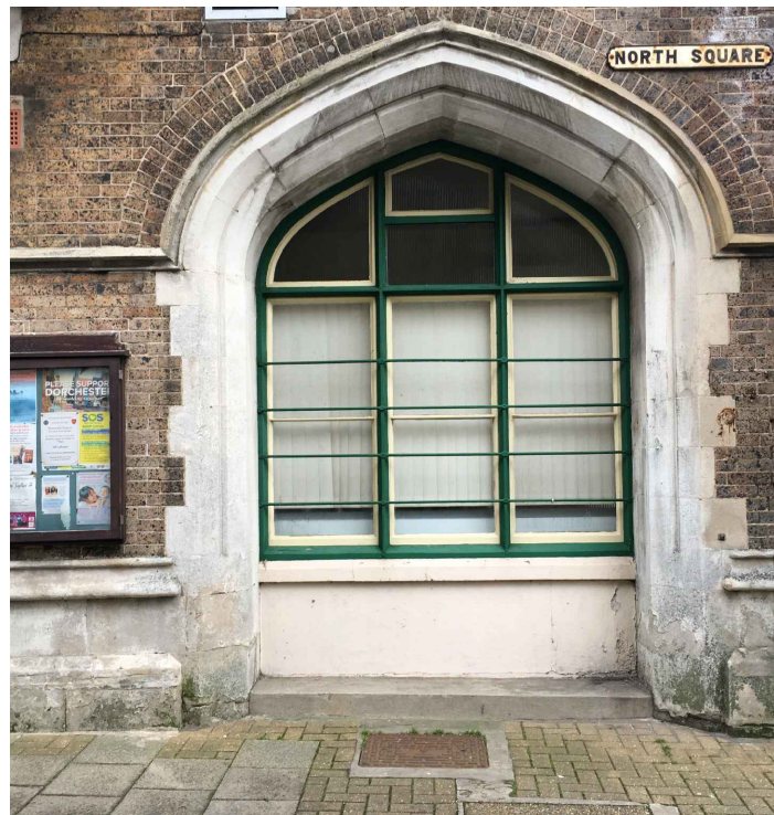
PHOTO OF EXISTING WINDOW ON WEST ELEVATION