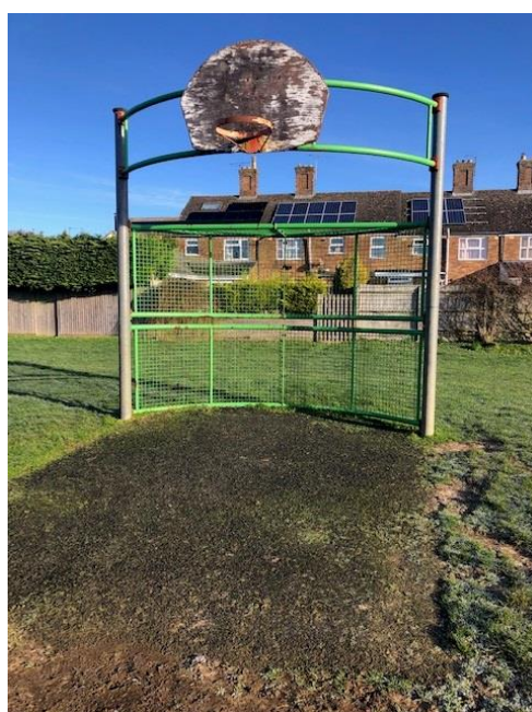
Goal End to be replaced