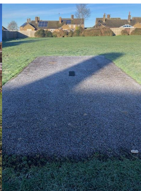
Surface where See-Saw was located