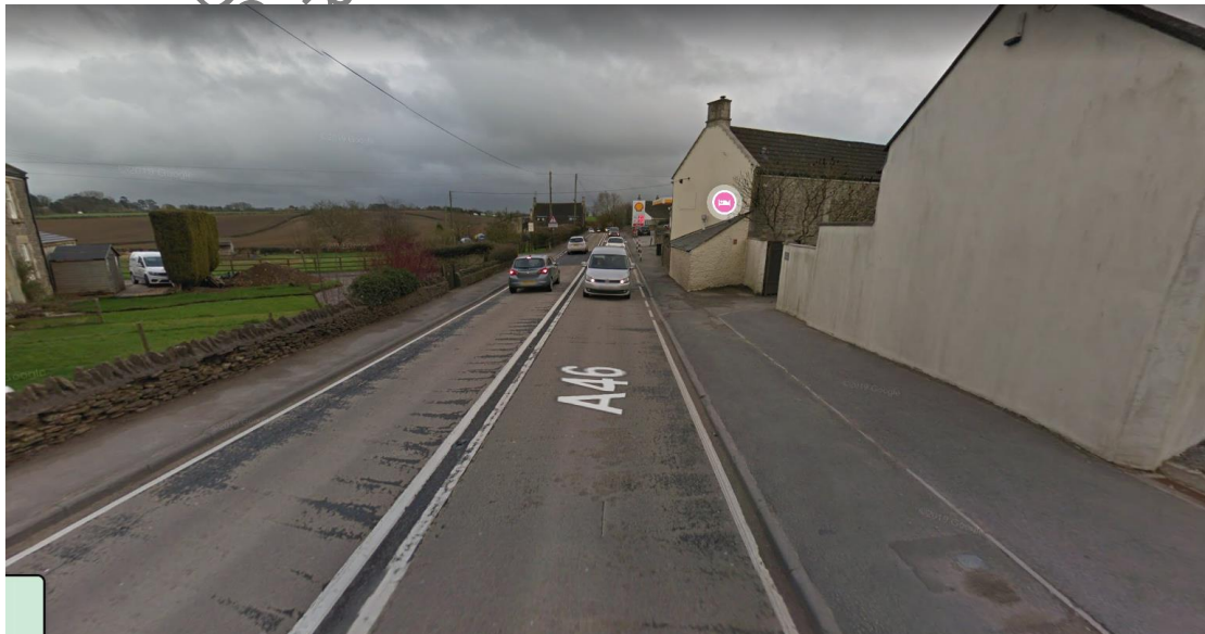
MP7.6 looking south of A46

The A36 in this location is single carriageway with an average width of 7.3m. No excavation is required in the main carriageway or footway.