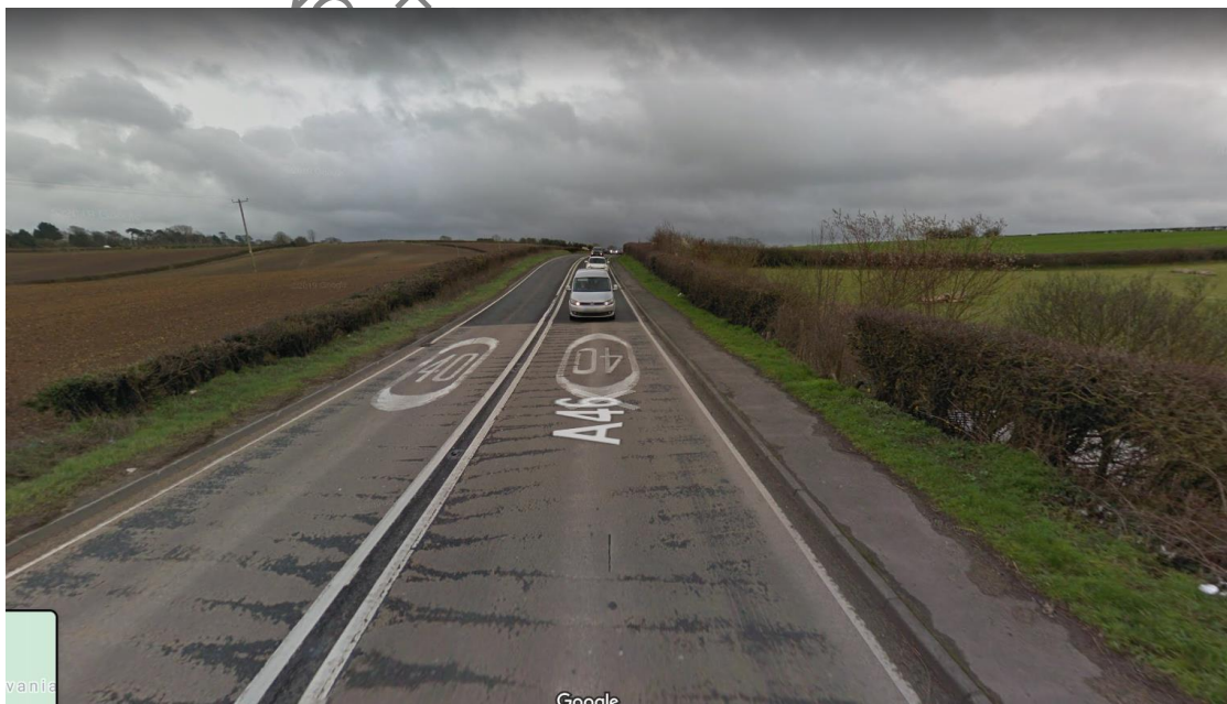
MP7.4 looking south of A46