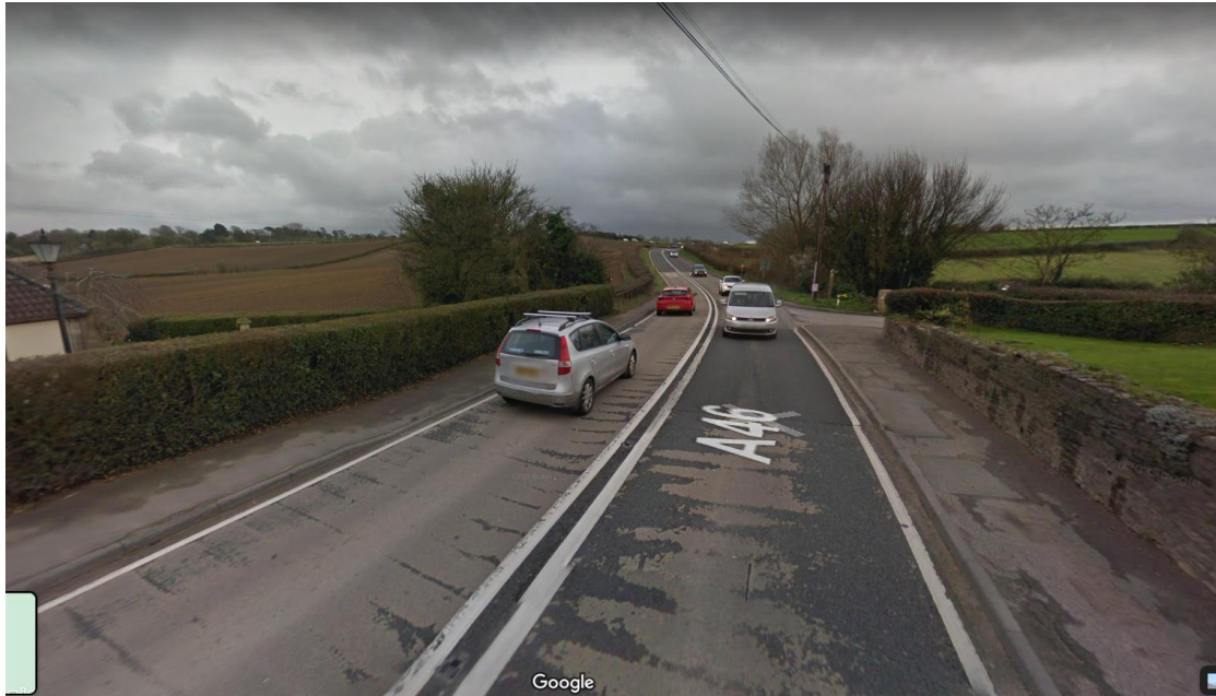
MP7.5 looking south of A46