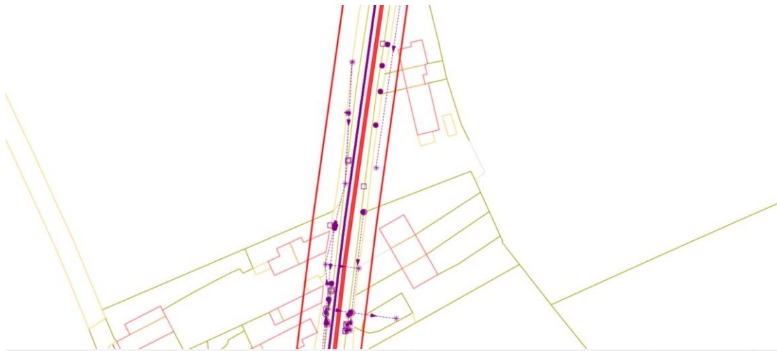
HE drainage assets