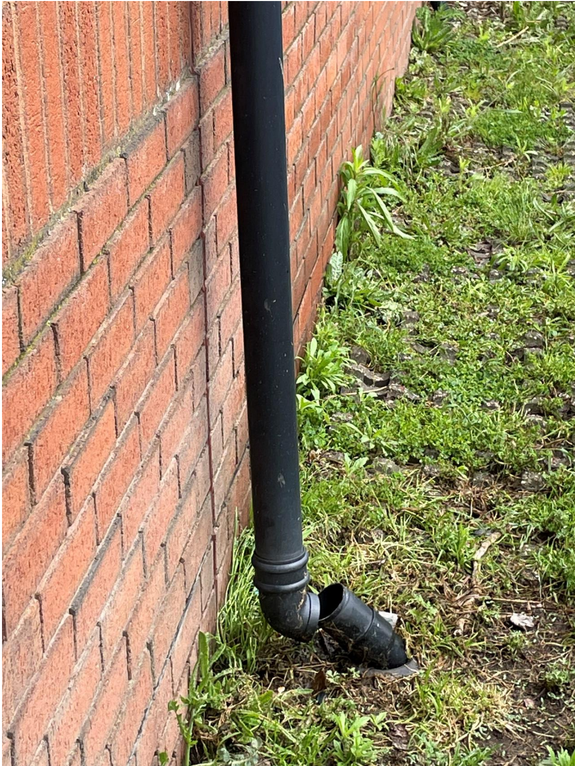
5) In Front of car charger