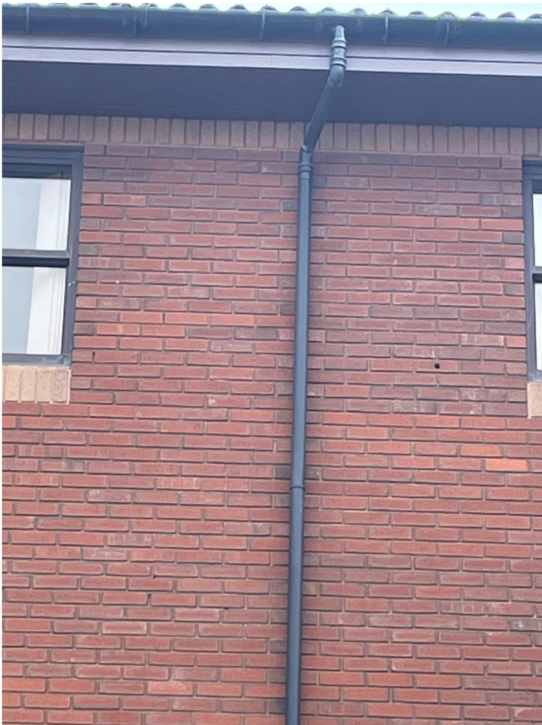
2b) Guttering beside Plant Room