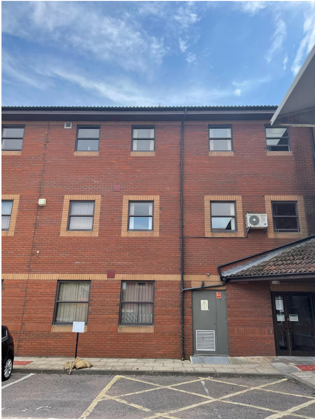
2a) Guttering beside Plant Room