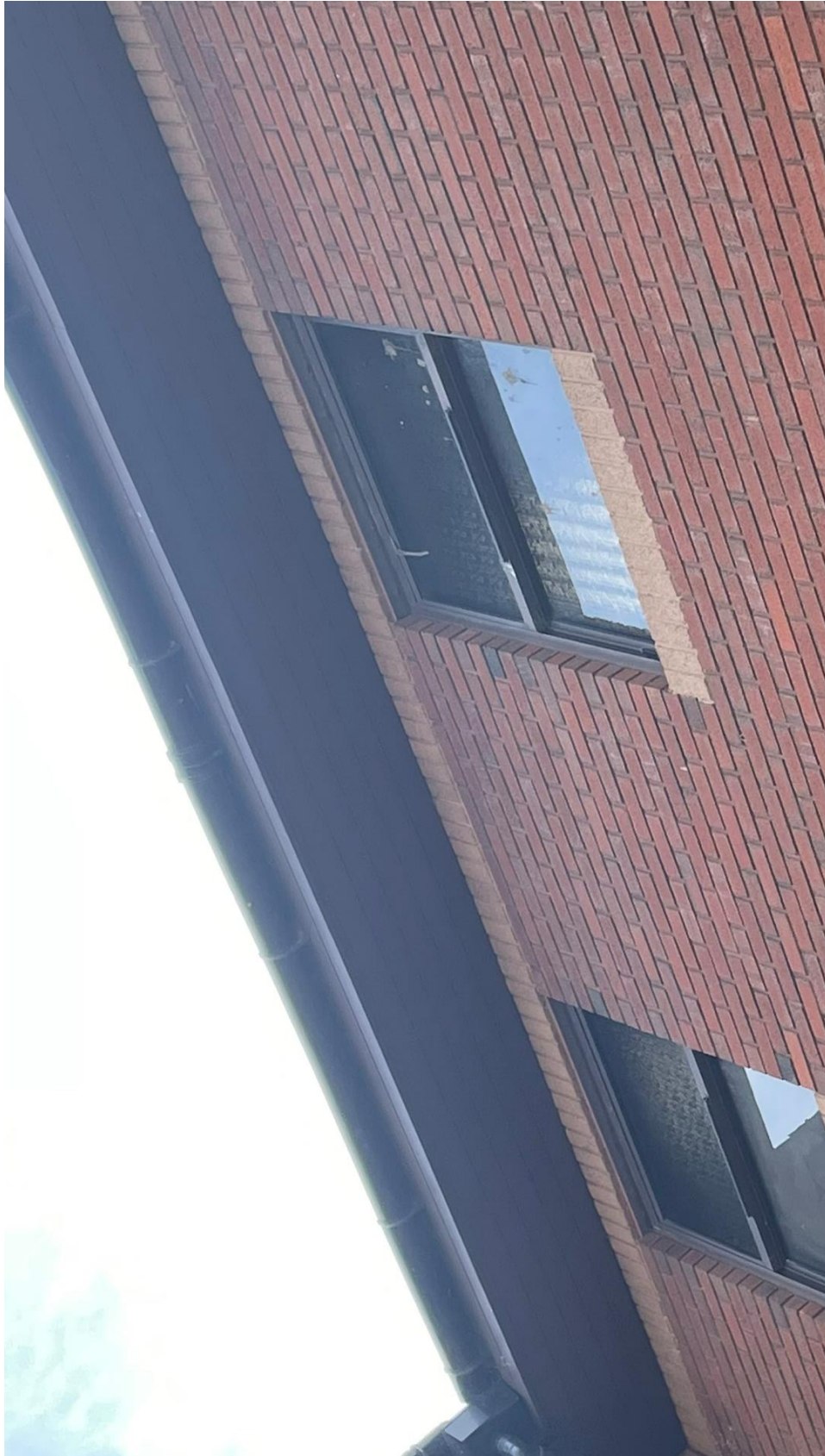
3b) Guttering above Server/Patch Panel Room