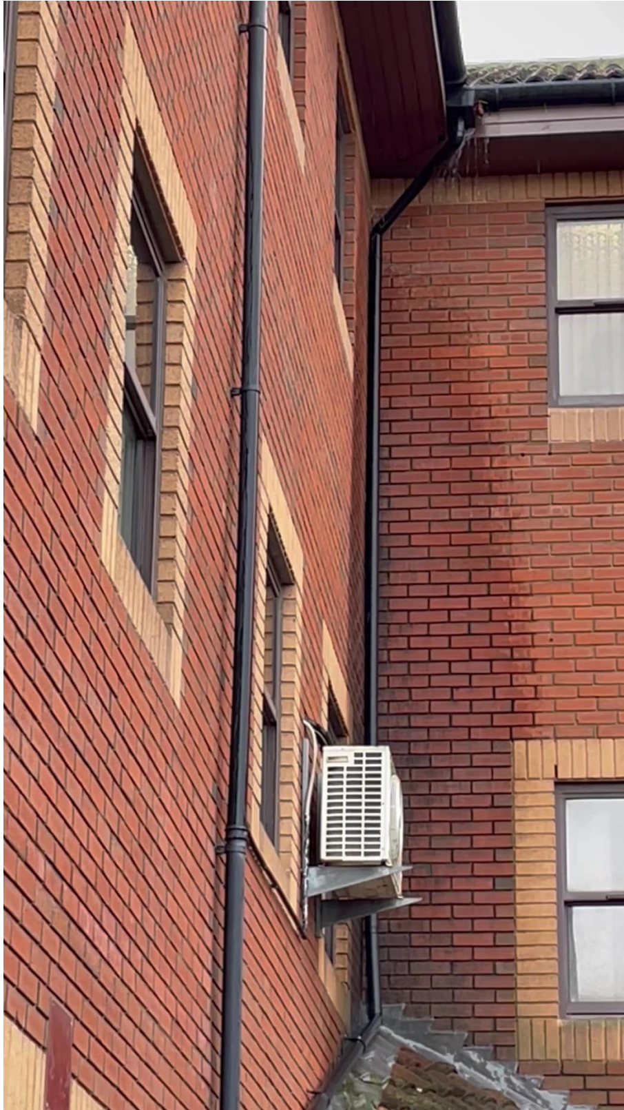
1b) Guttering & Downpipe above Out of Hours doors