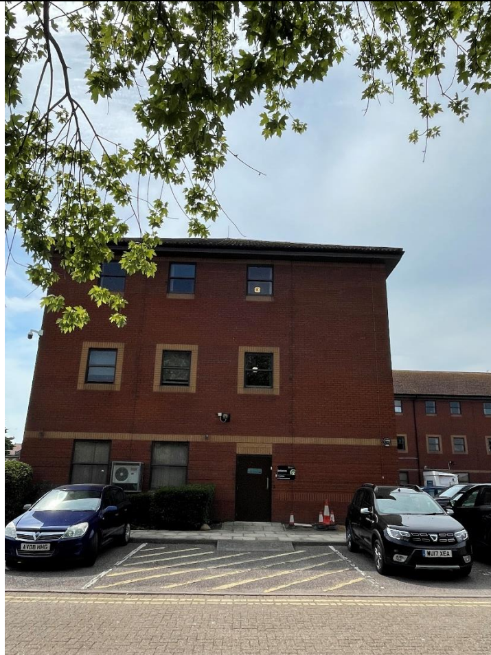
4a) Above the FM Delivery Door