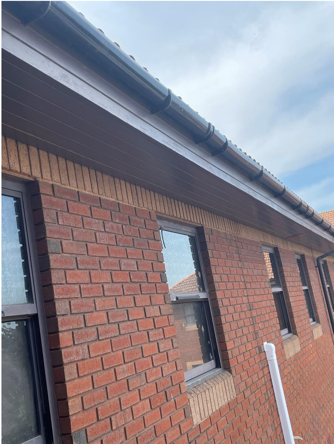
3a) Guttering above Server/Patch Panel Room