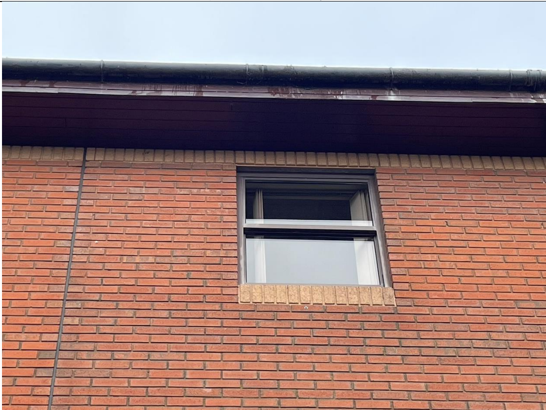
4b) Above the FM Delivery Door