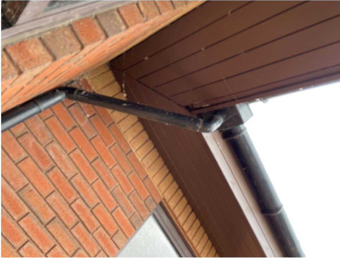
1b) Guttering & Downpipe above Out of Hours doors