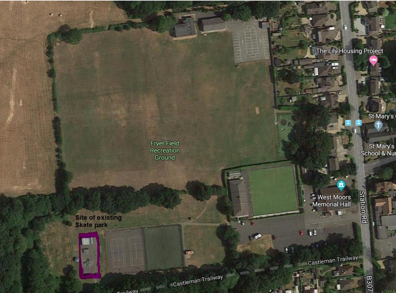
Aerial View of Fryer Field, showing location of current skatepark.