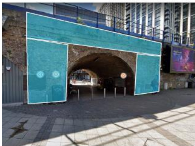
Location 3: Mepham St. / A301

Plinth and opportunity to extend the design to the arch as in the picture below.