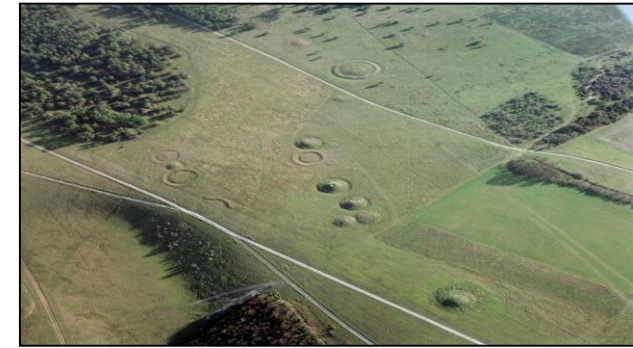
Significant Archaeological Landscapes in NW Europe