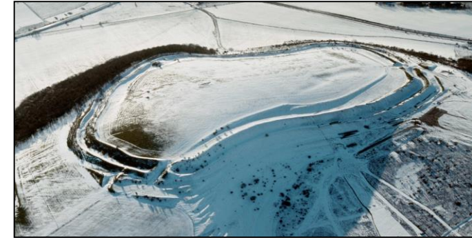
Over 2,500 Archaeological Sites Over 360 Scheduled Monuments