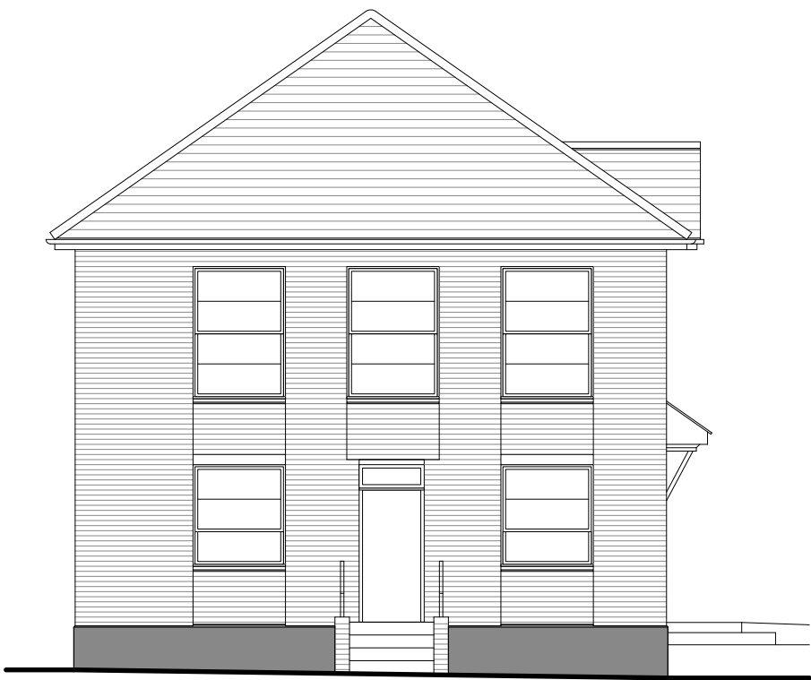
SIDE (SOUTH) ELEVATION