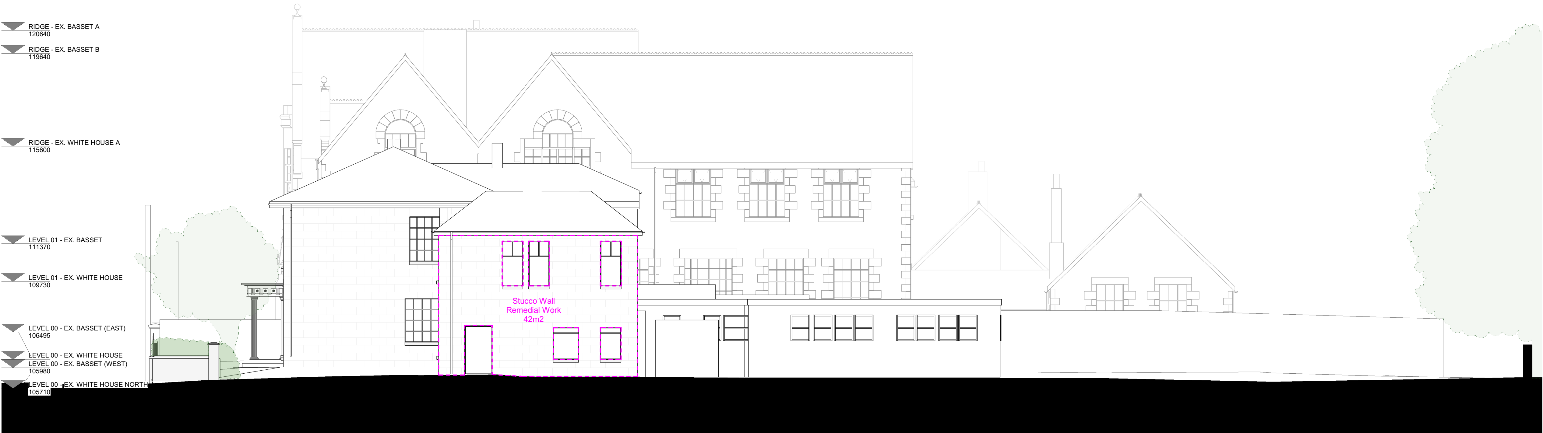
1 ELEVATIONS - GA - EXISTING - NORTH - GRANITE FACADE REPAIR & REPOINTING 1 : 100