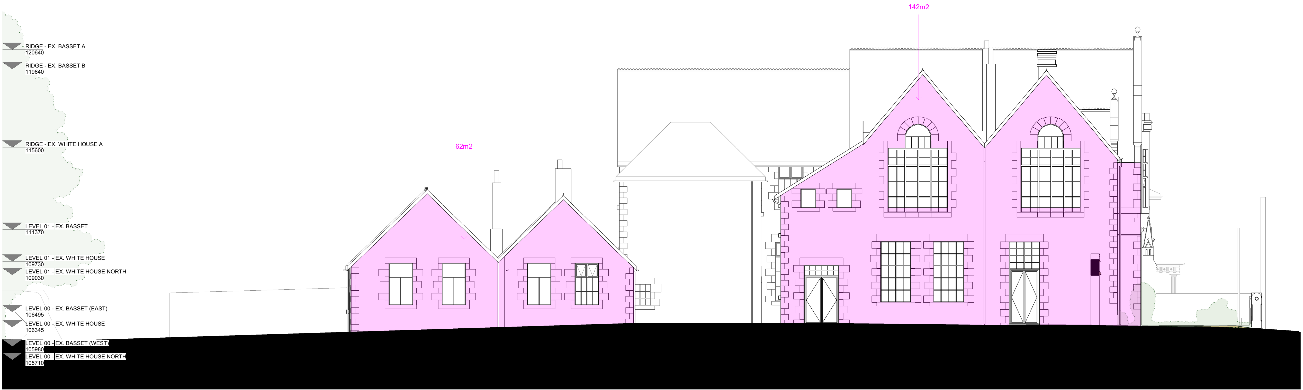
2 ELEVATIONS - GA - EXISTING - SOUTH - GRANITE FACADE REPAIR & REPOINTING 1 : 100