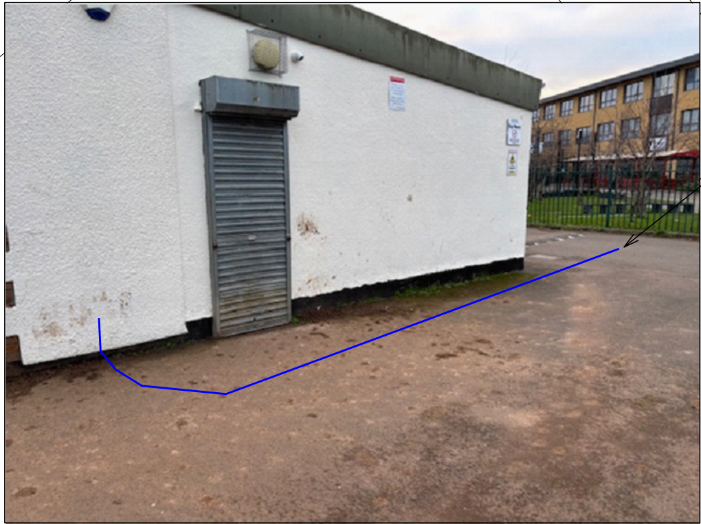
New Cable Route