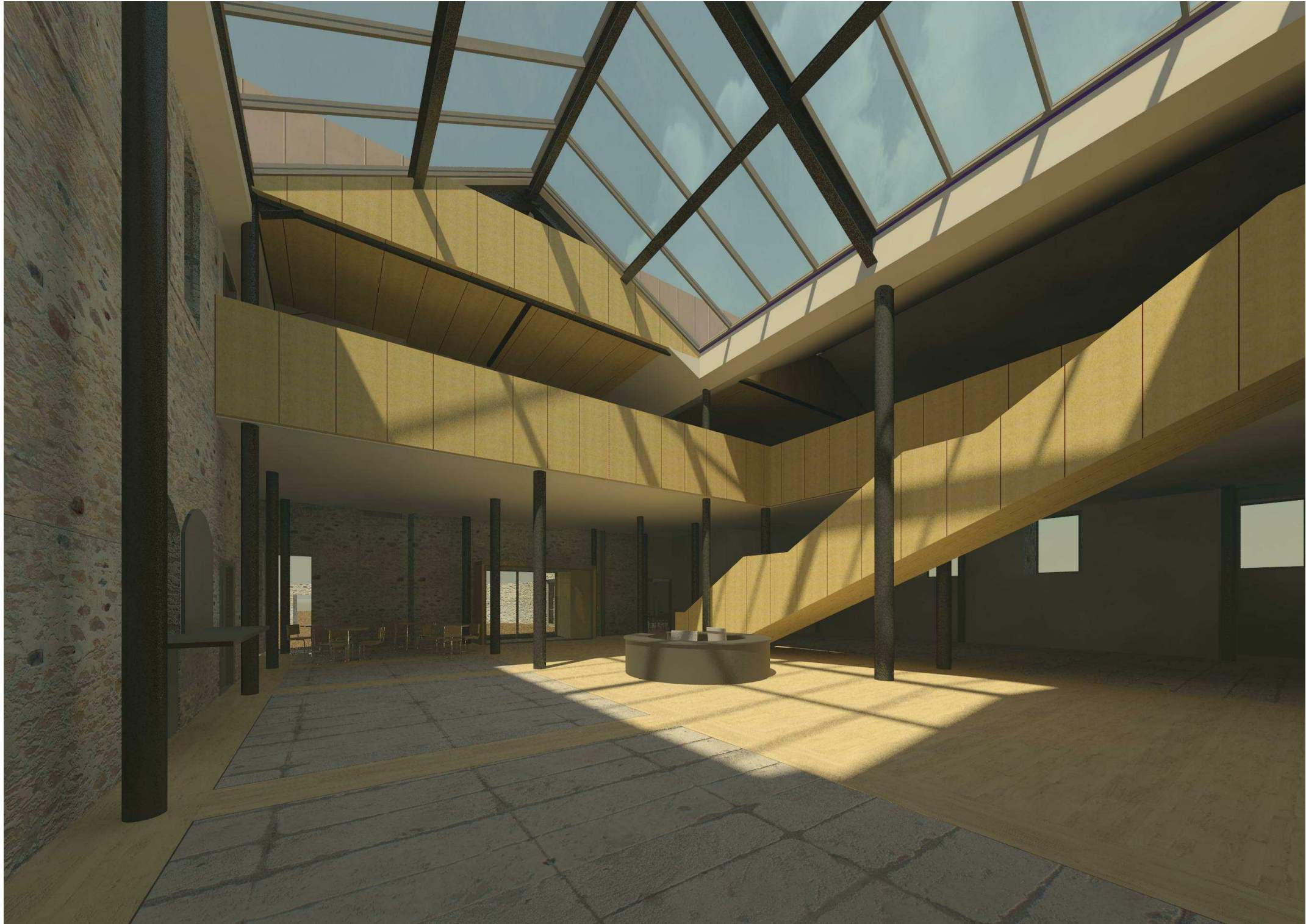
1 960 View from ground floor looking toward West entrance 1 : 1