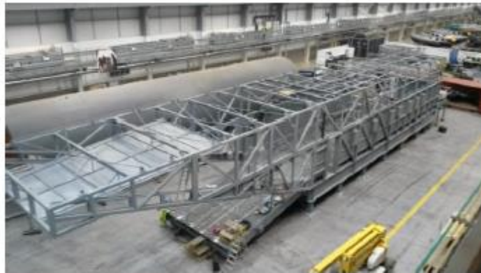
Air Dispatch - ATLAS Part Task Trainer (PTT) B