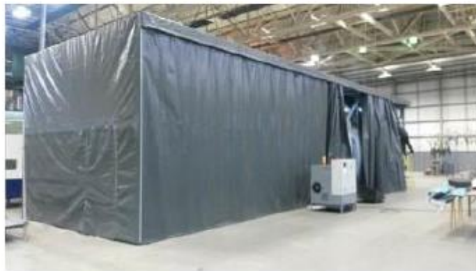
Parachute Training School - ATLAS Part Task Trainer (PTT) C