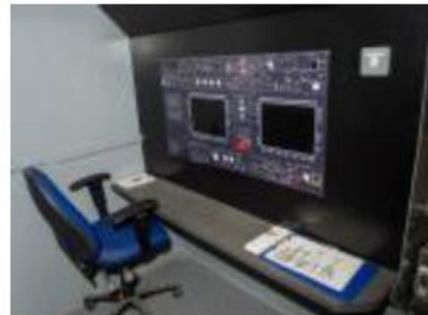
Air Movements School - ATLAS Part Task Trainer (PTT) A